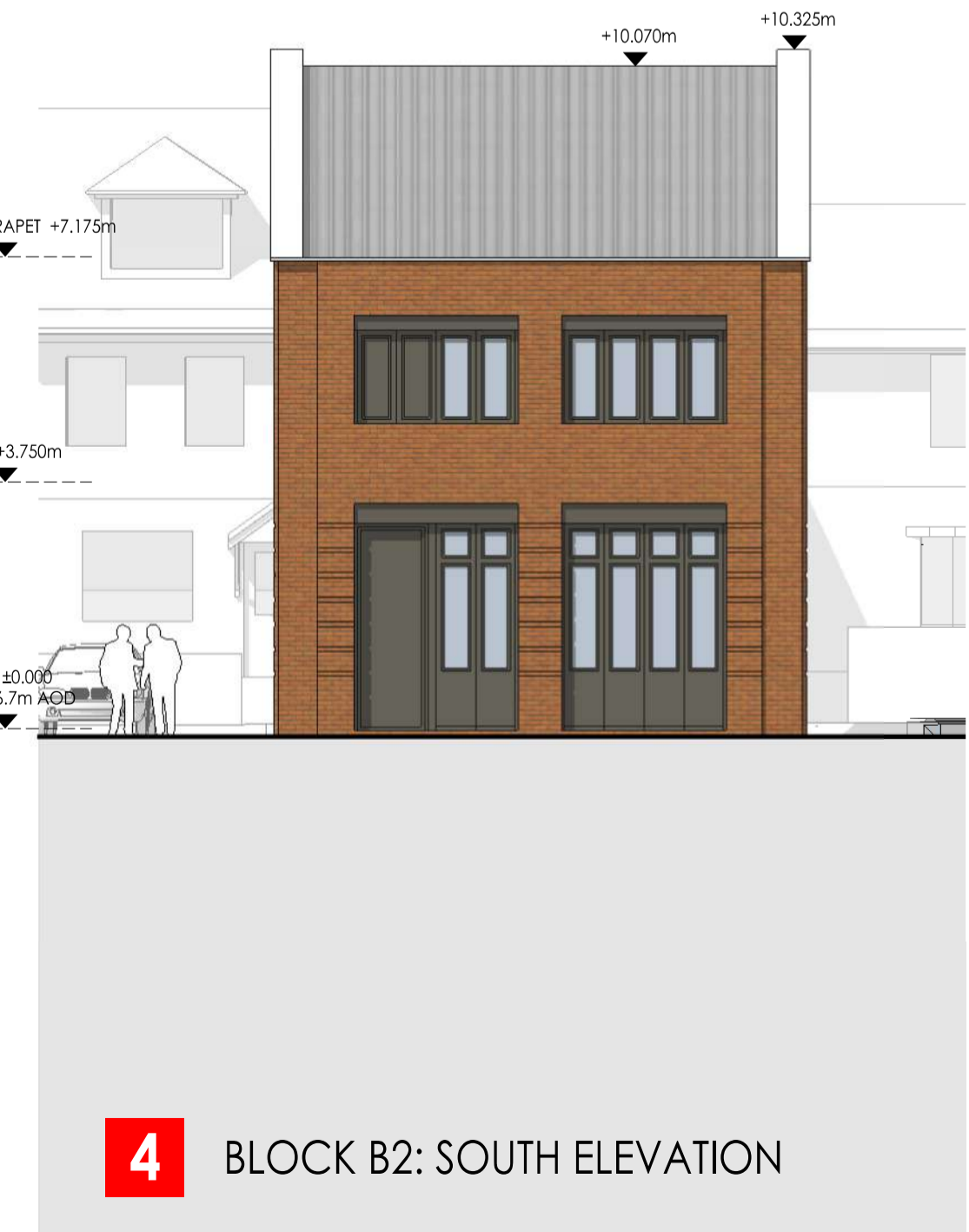
4 BLOCK B2: SOUTH ELEVATION