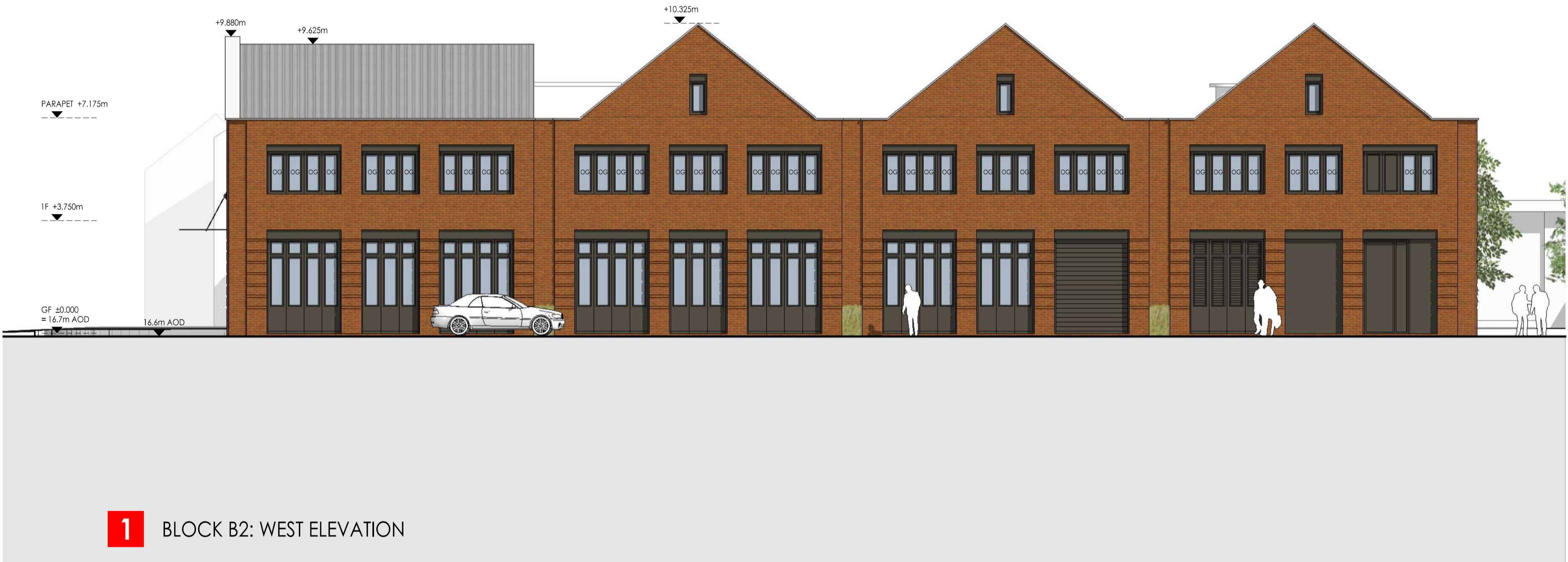
1 BLOCK B2: WEST ELEVATION