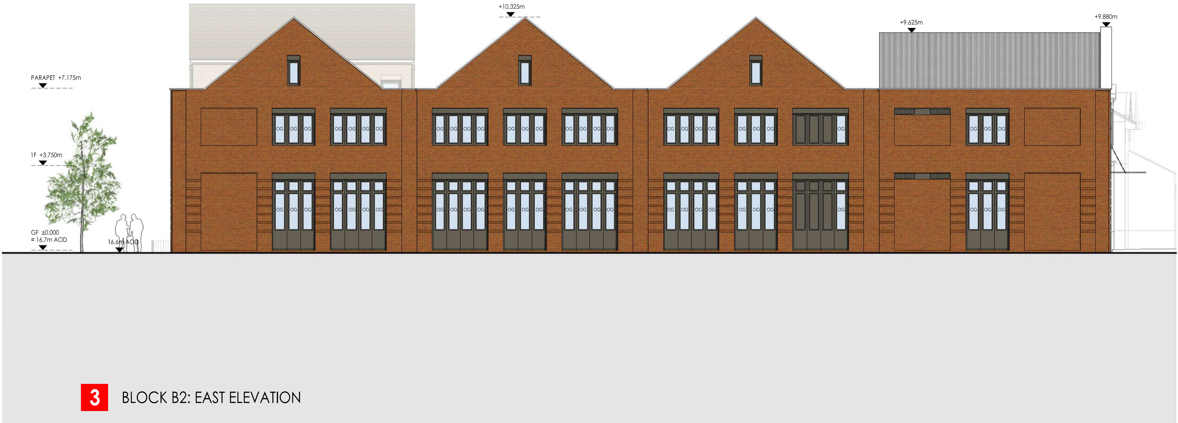
3 BLOCK B2: EAST ELEVATION