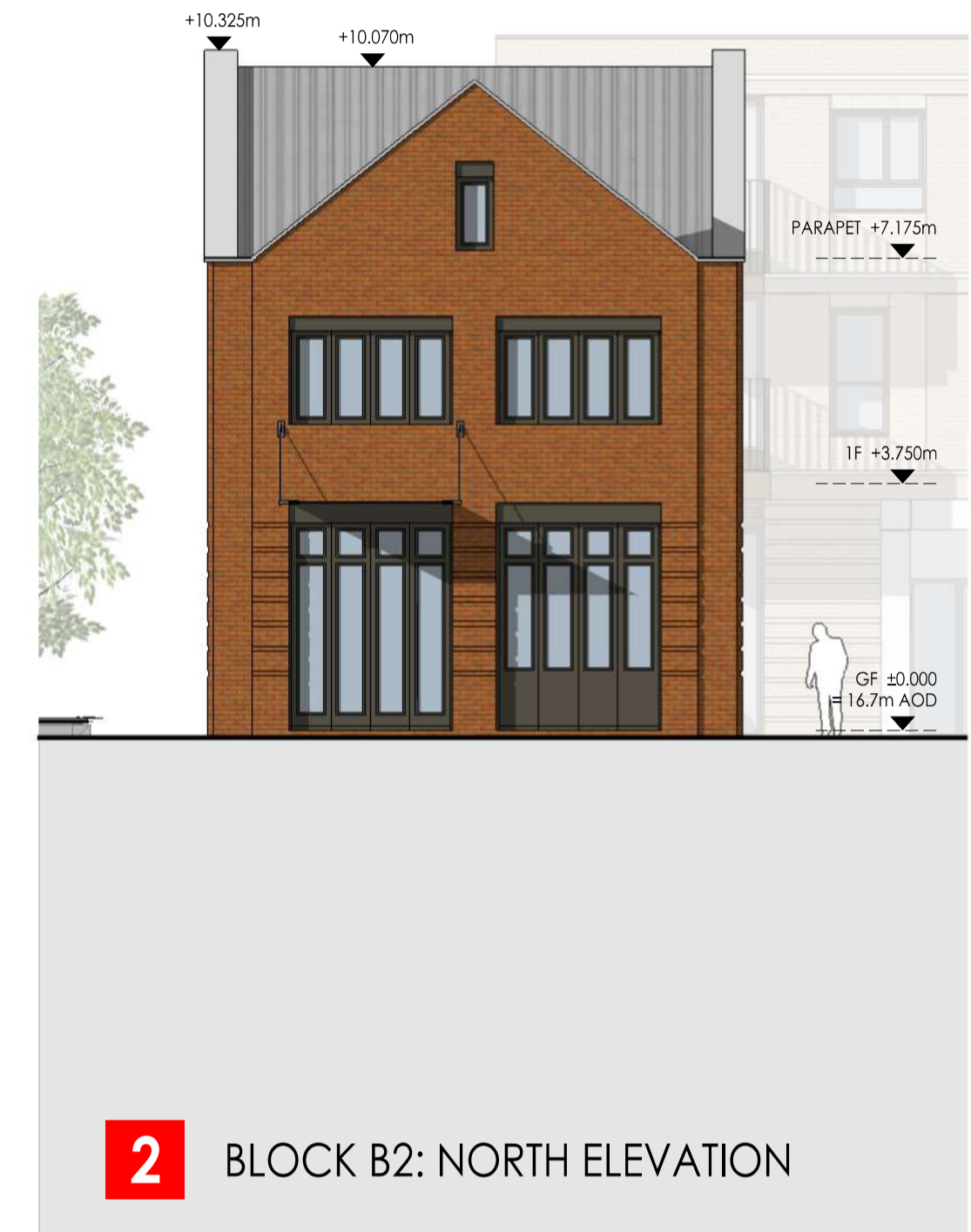
2 BLOCK B2: NORTH ELEVATION