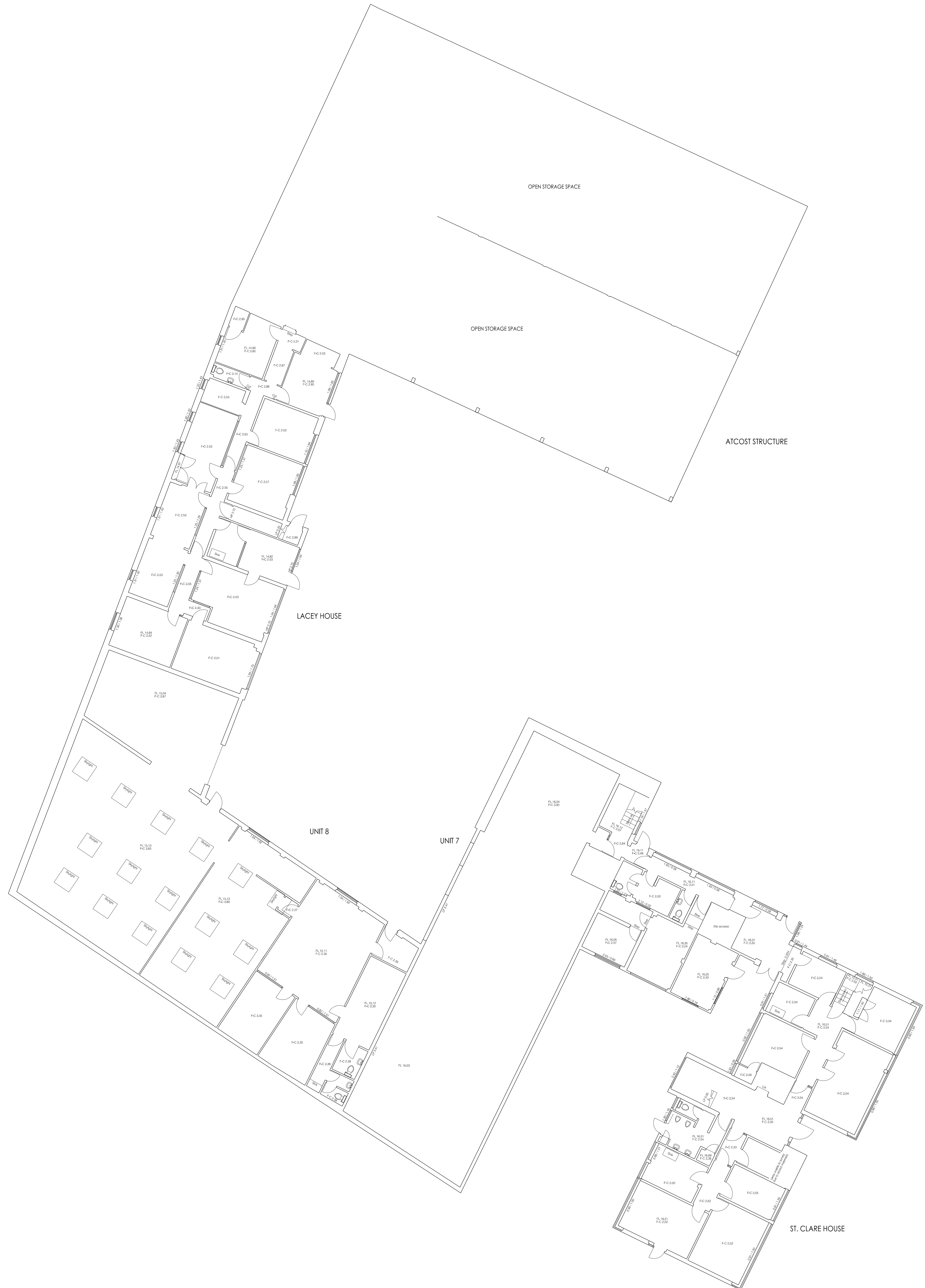
EXISTING GROUND FLOOR PLAN (SOUTH SIDE)