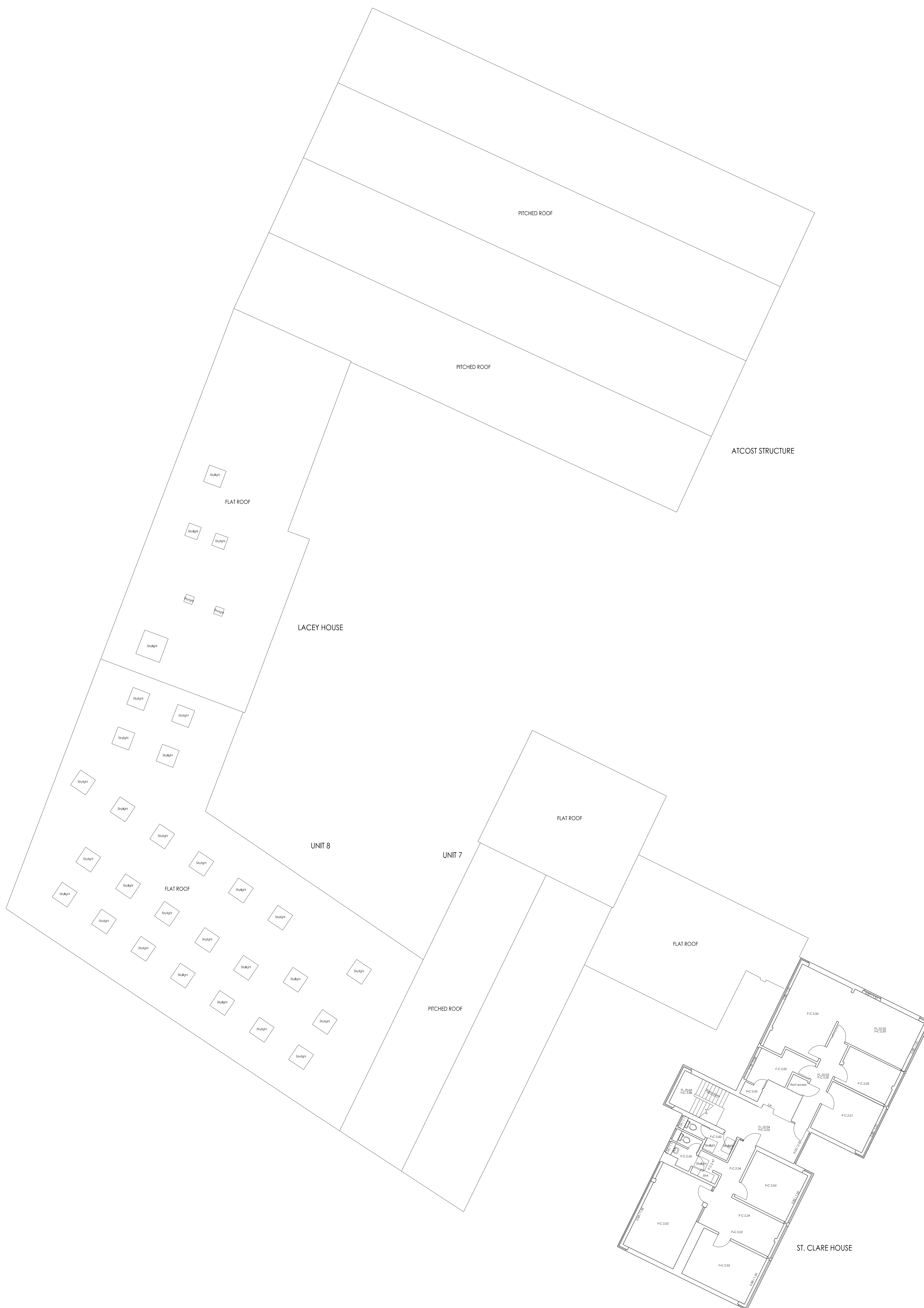
EXISTING SECOND FLOOR PLAN (SOUTH SIDE)