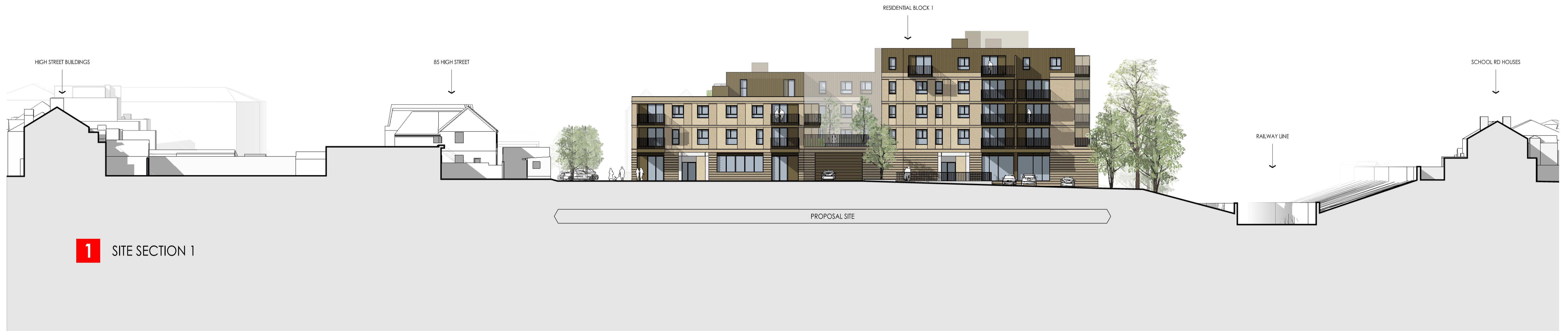
1 SITE SECTION 1