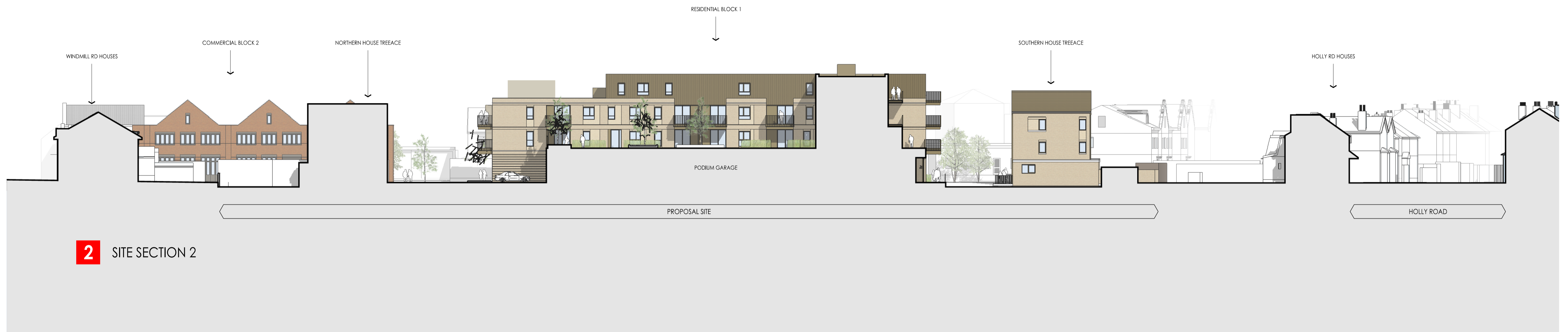
2 SITE SECTION 2