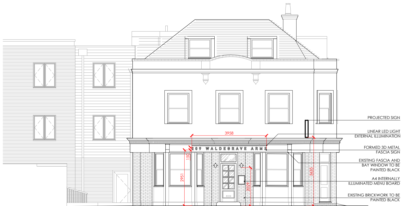
01 FRONT ELEVATION 0 1 2 3 4 5 M Scale 1:100