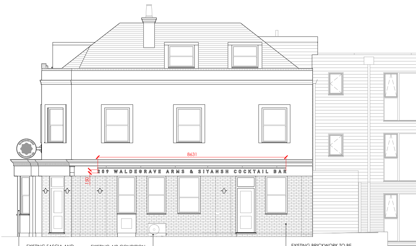
02 SIDE ELEVATION 0 1 2 3 4 5 M Scale 1:100