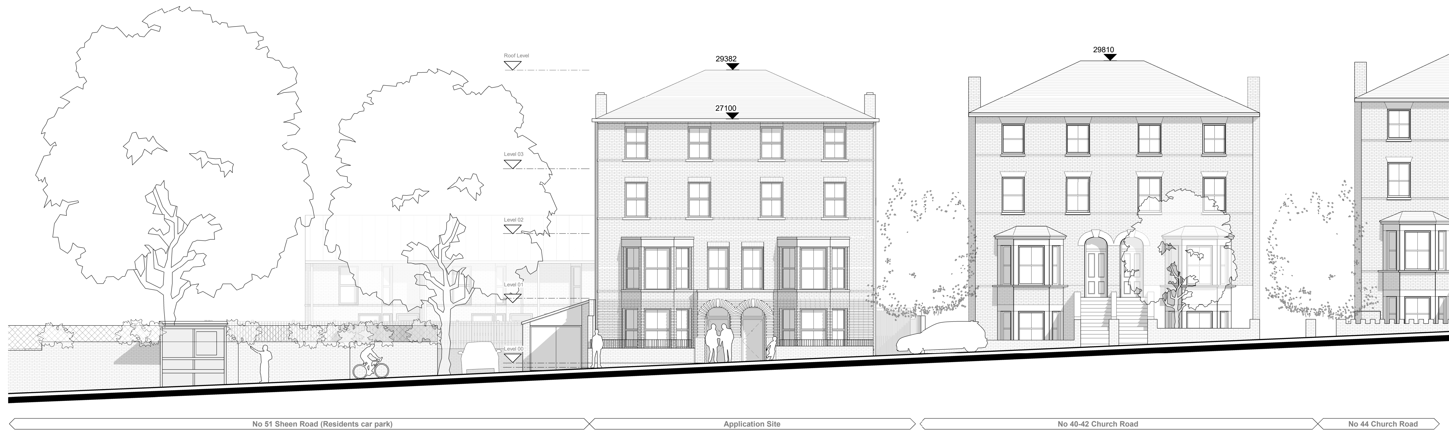
1 Proposed West Elevation 1 : 100