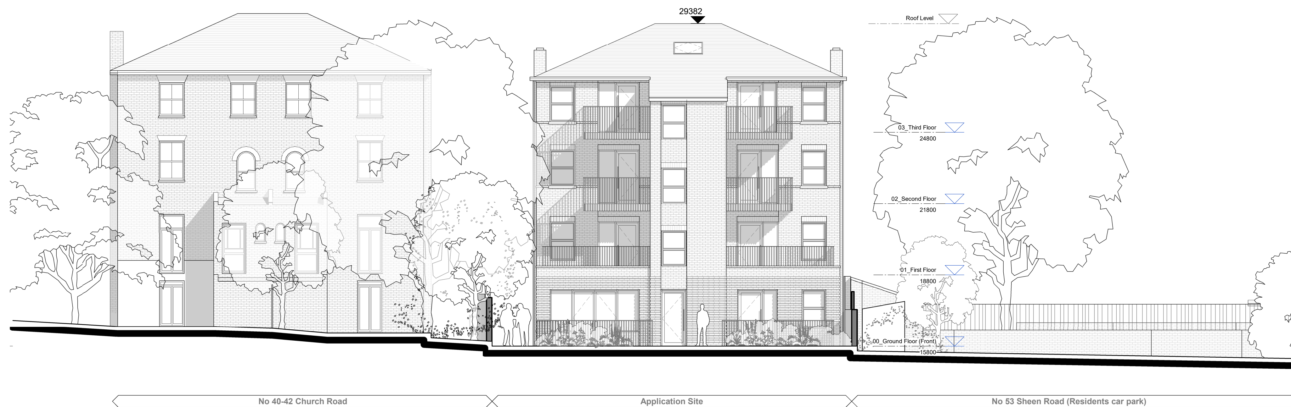
2 Proposed Mansion East Elevation 1 : 100