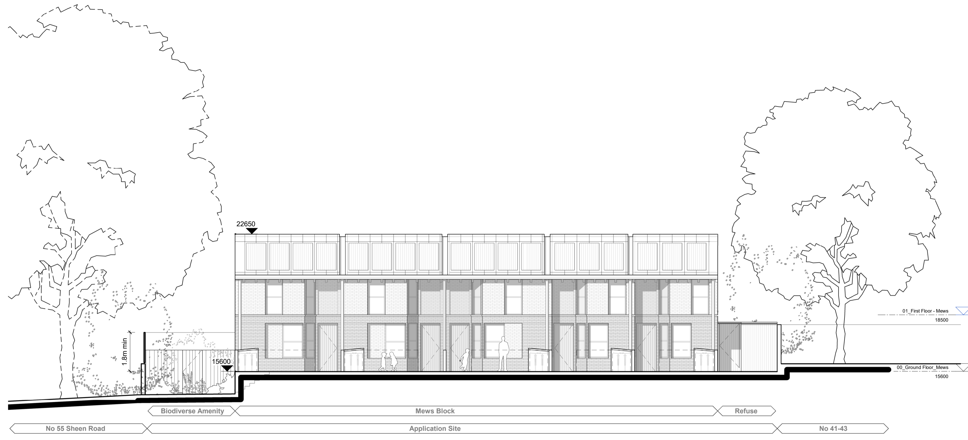
1 Proposed Mews West Elevation 1 : 100