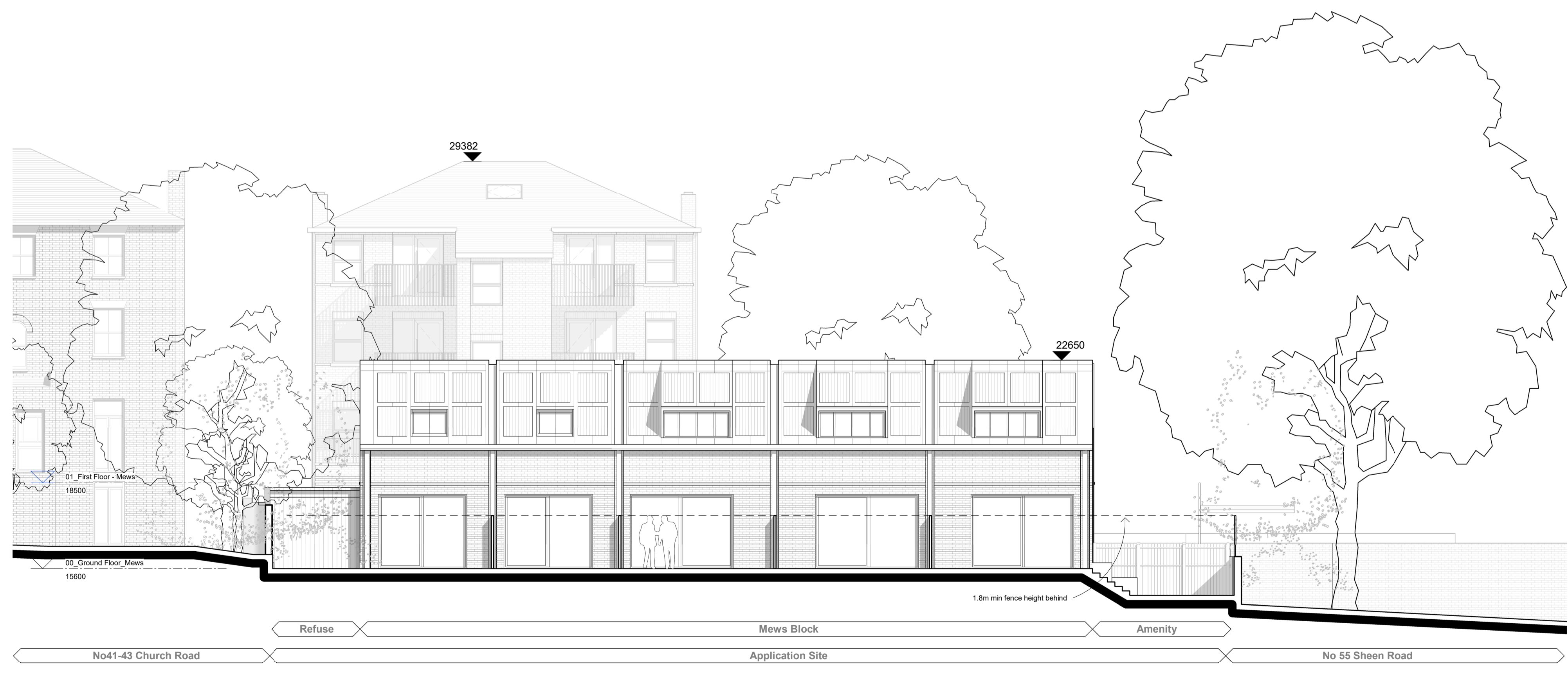
2 Proposed East Elevation 1 : 100