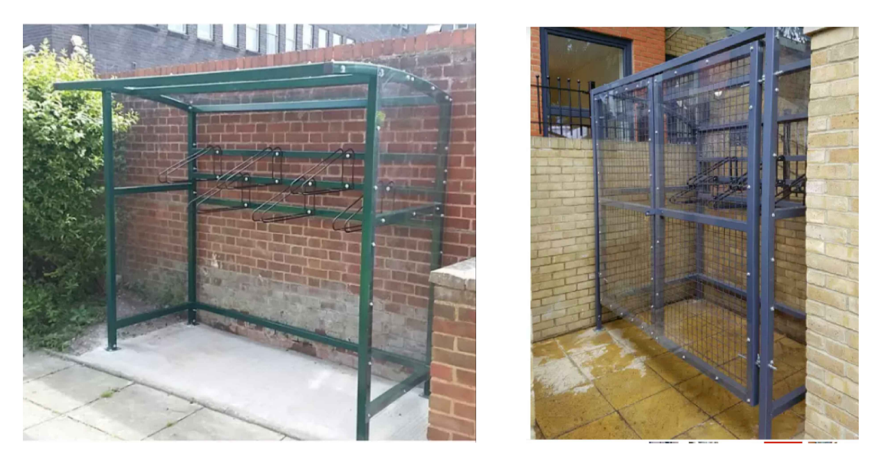
INDICATIVE IMAGE OF PROPOSED COMMUNAL CYCLE STORE

WASTE CALCULATIONS IN ACCORDANCE WITH LONDON BOROUGH OF RICHMOND REFUSE AND RECYCLING STORAGE REQUIREMENTS FOR ONE 2 BEDROOM HOUSE THE FOLLOWING SHOULD BE PROVIDED: 240L REFUSE 102L DRY RECYCLING (2 NO 55 LITRE RECYCLING BOXES) 29L FOOD PER UNIT FOR FOUR 2 BEDROOM FLATS THE FOLLOWING SHOULD BE PROVIDED: 560L REFUSE (BASED ON 70 LITRES PER BEDROOM) 480L DRY RECYCLING (1 NO 240 LITRE BIN FOR MIXED PAPER AND 1 NO 240 LITRE BIN FOR MIXED CONTAINERS) 29L FOOD PER UNIT