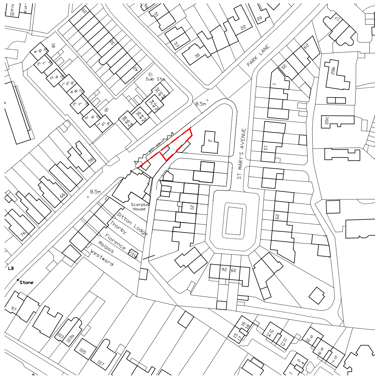
1365 - Park Lane Stables Location Plan 1: 1250 @ A3