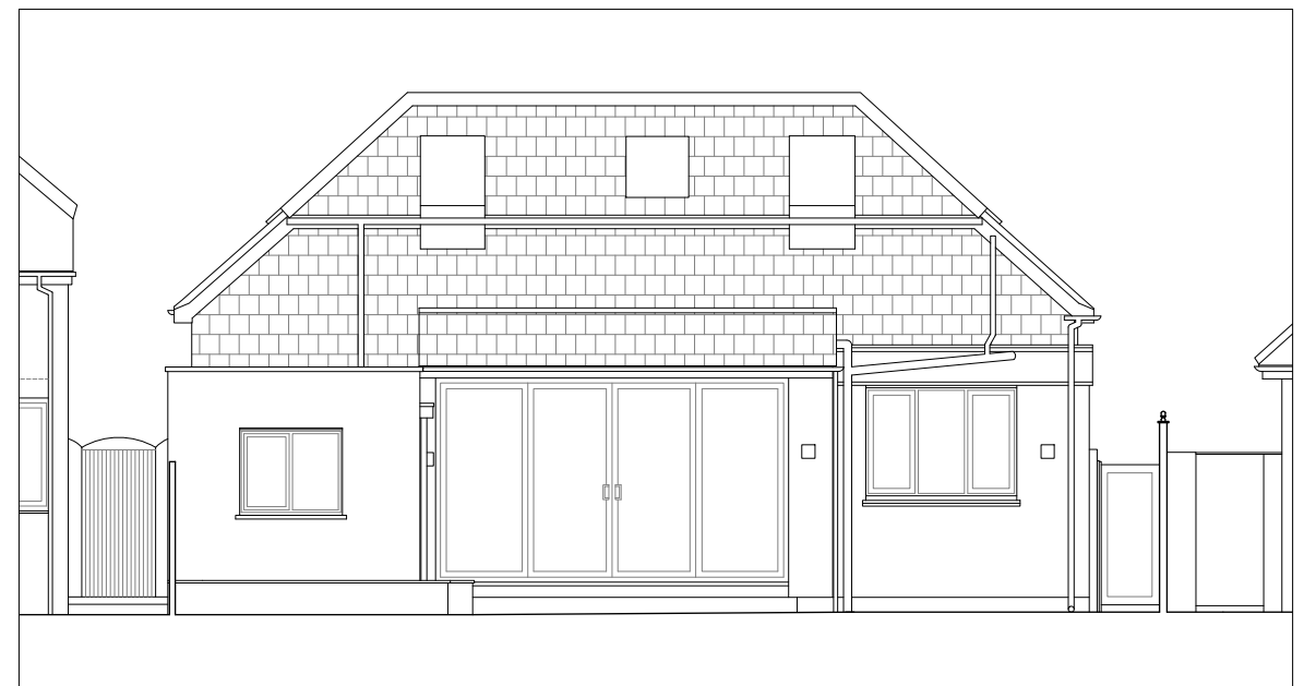
04 Existing Rear Elevation 1:100 @ A3

DISCLAIMER: All dimensions are in millimetres. Do not scale from this drawing. All dimensions and conditions are to be checked and confirmed on site by the contractor. The contractor should inform the Architect of any discrepancies before proceeding with the work. This drawing is to be read in conjunction with all other relevant documentation including that produced by other consultants, subcontractors and suppliers. All elements of work and materials are to comply with the Building Regulations, British Standards, good industry practice and the recommendations of material and component manufacturers. All products are to be suitable for their purpose. The contractor is to install all products where noted in accordance with manufacturers recommendations, specifications and inform the Architect of any discrepancies or changes in the specification before proceeding with the work. This drawing is the property of ARCHANAÆUM LTD. Copyright is reserved by them and the drawing is issued on the condition that it is not copied, reproduced, retained or disclosed to any unauthorised person or company, either wholly or in part, without written consent.