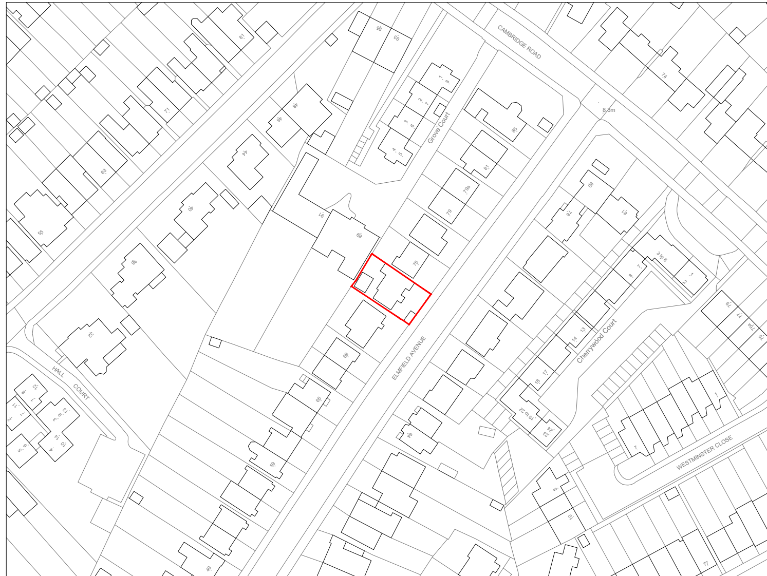
01 Site Location Plan 1:1250 @ A3

DISCLAIMER: All dimensions are in millimetres. Do not scale from this drawing. All dimensions and conditions are to be checked and confirmed on site by the contractor. The contractor should inform the Architect of any discrepancies before proceeding with the work. This drawing is to be read in conjunction with all other relevant documentation including that produced by other consultants, subcontractors and suppliers. All elements of work and materials are to comply with the Building Regulations, British Standards, good industry practice and the recommendations of material and component manufacturers. All products are to be suitable for their purpose. The contractor is to install all products where noted in accordance with manufacturers recommendations, specifications and inform the Architect of any discrepancies or changes in the specification before proceeding with the work. This drawing is the property of ARCHANAÆUM LTD. Copyright is reserved by them and the drawing is issued on the condition that it is not copied, reproduced, retained or disclosed to any unauthorised person or company, either wholly or in part, without written consent.