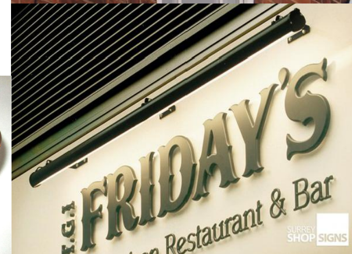
LINEAR EXTERNALLY ILLUMINATED LIGHT