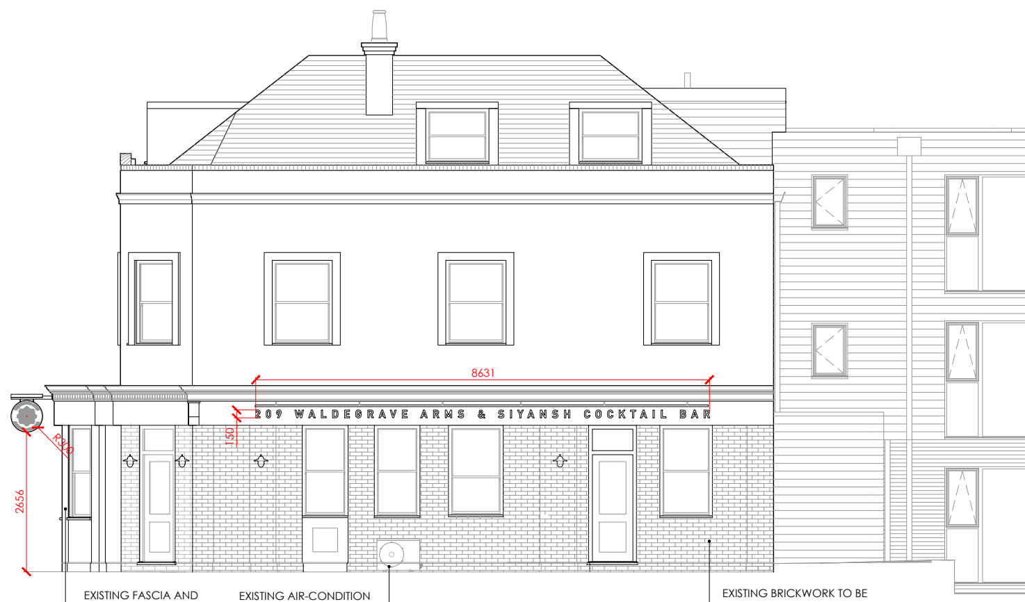
02 SIDE ELEVATION 0 1 2 3 4 5 M Scale 1:100