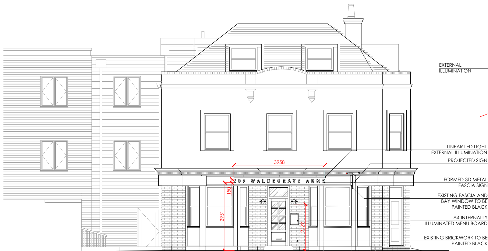
01 FRONT ELEVATION 0 1 2 3 4 5 M Scale 1:100