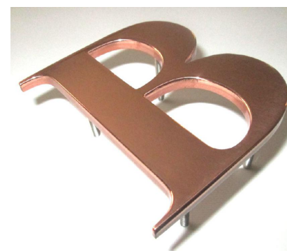
FORMED METAL 3D FASCIA SIGN