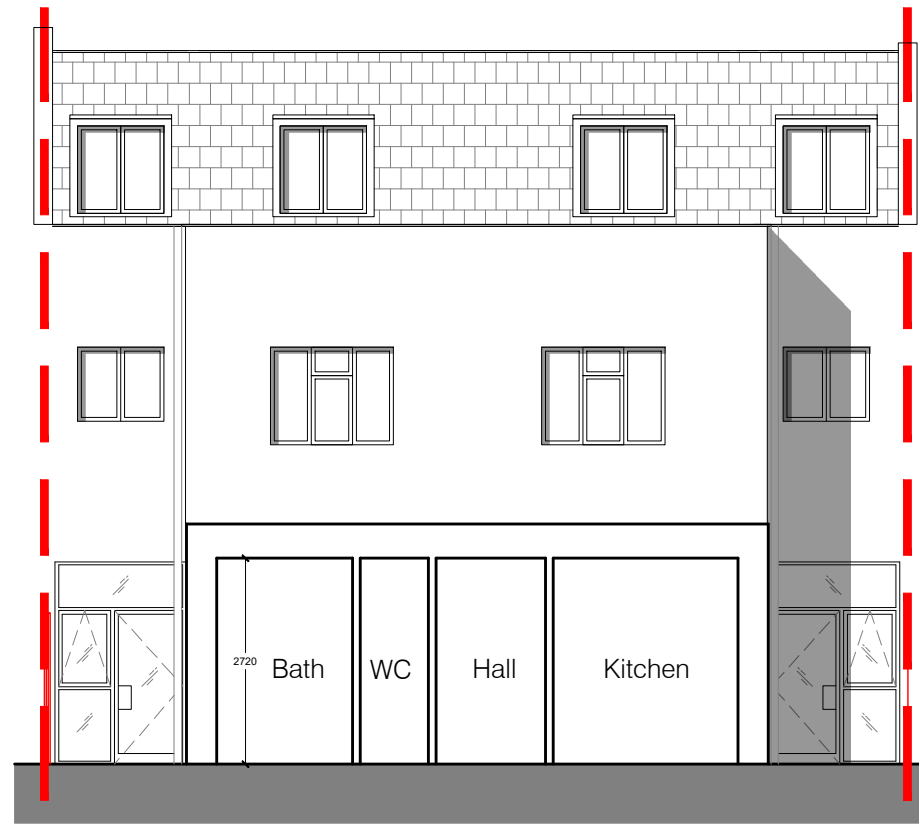
Proposed Section B-B