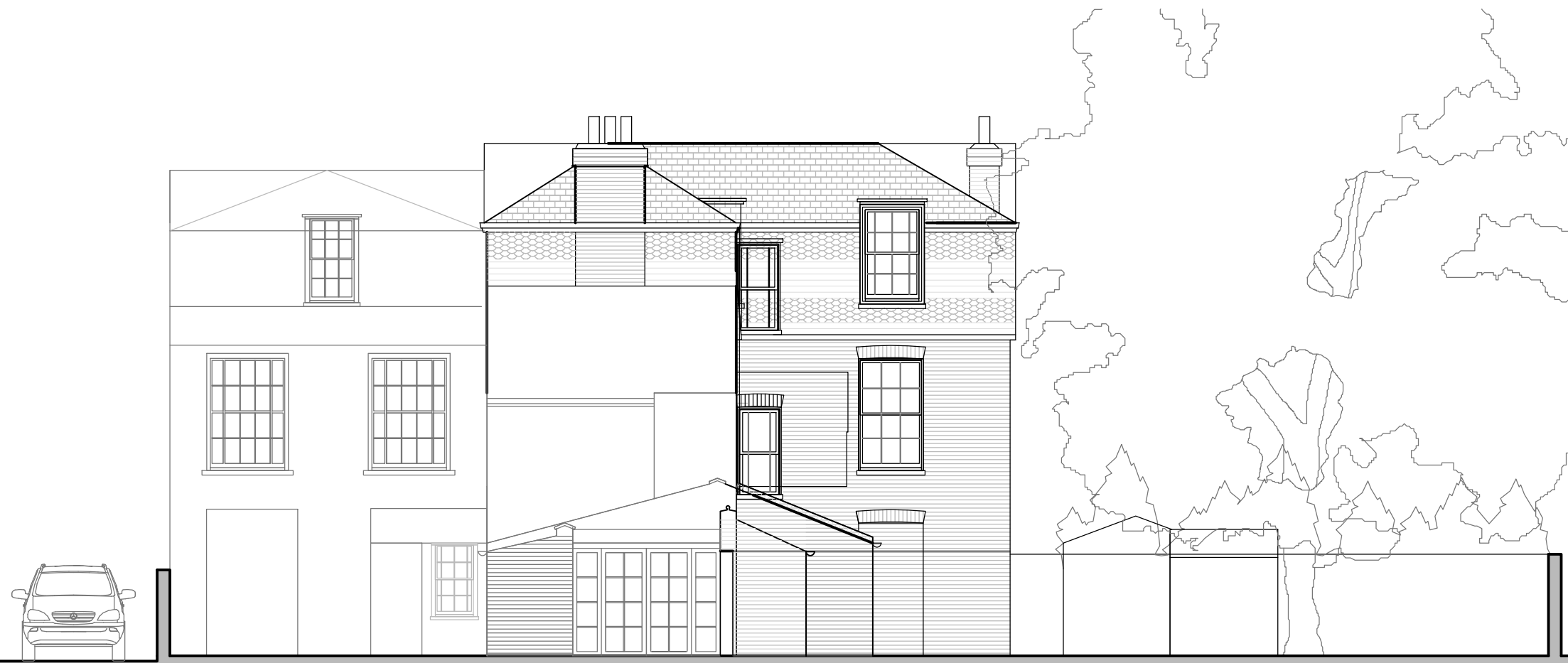
1 Existing Rear Elevation Scale: 1:100