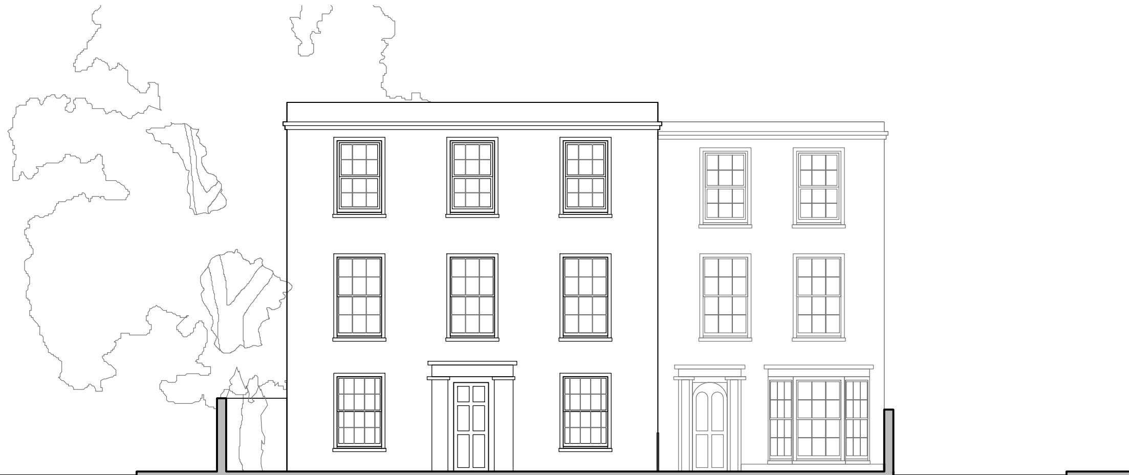
1 Existing Front Elevation Scale: 1:100