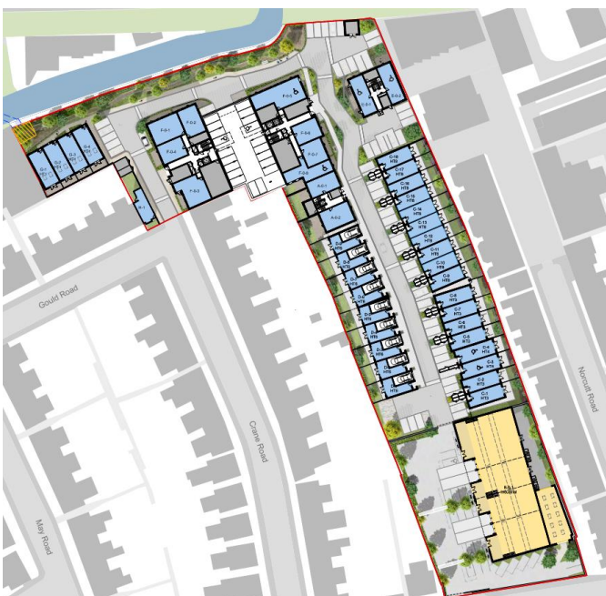
Figure 1: Application site plan

The application site plan is shown in Figure 1.