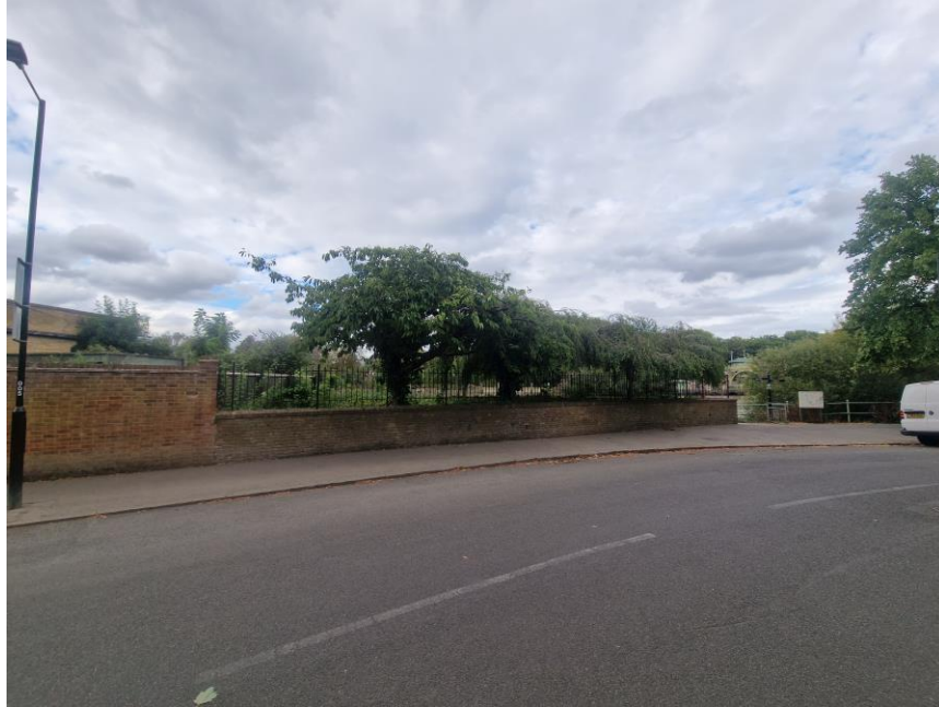
Showing T1 – T3 contained within a raised garden space.