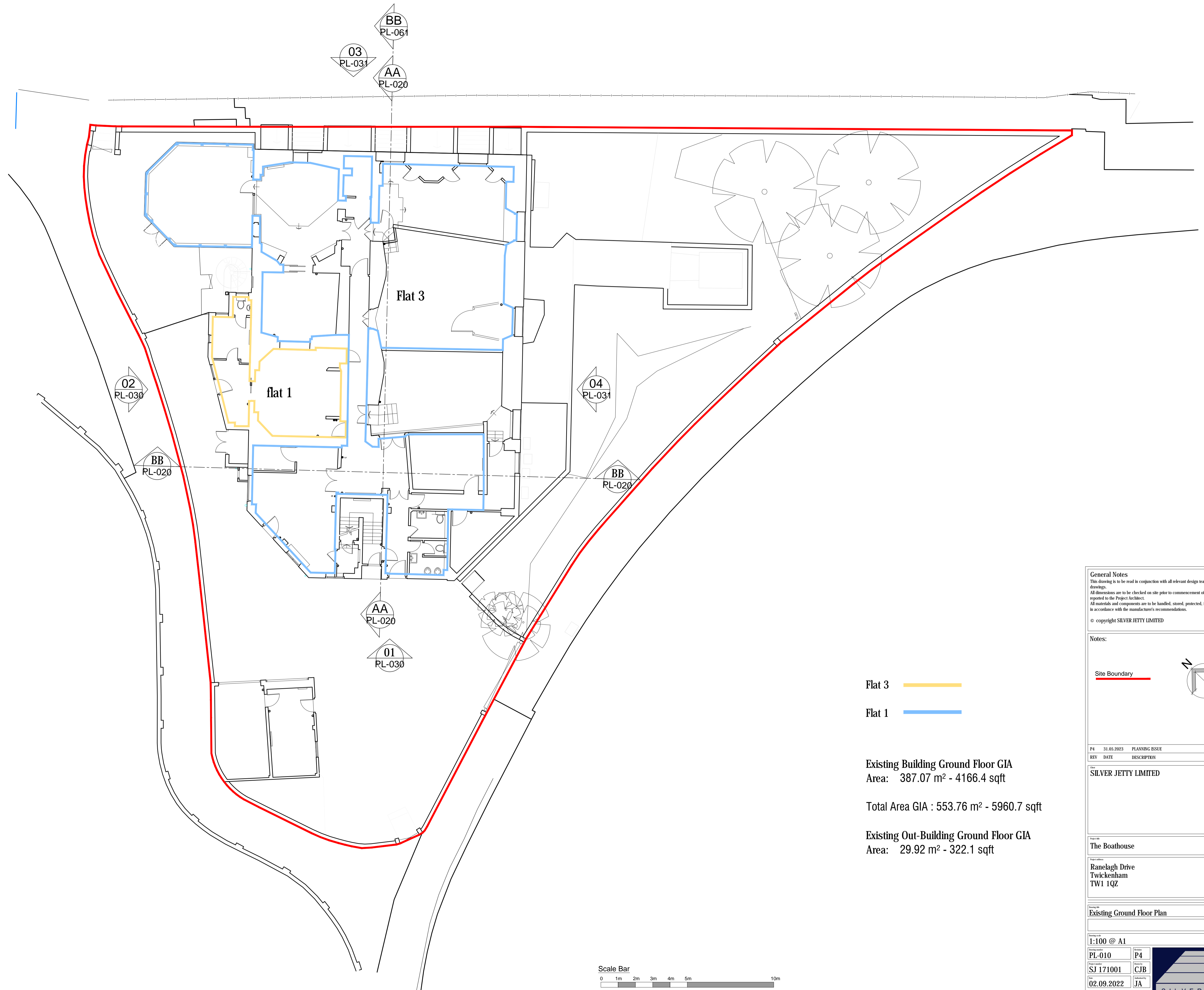
Existing Ground Floor Plan Scale @ 1:100