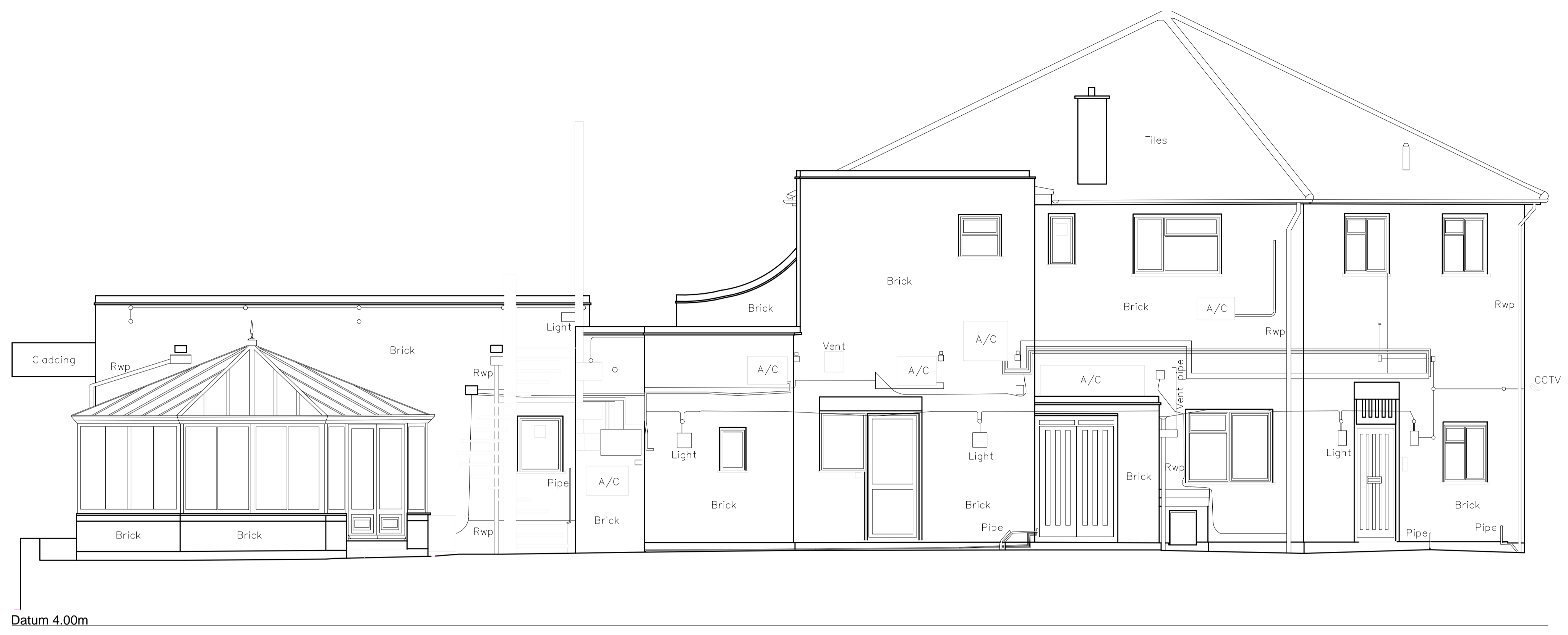
Existing West Elevation 02 Scale @ 1:50