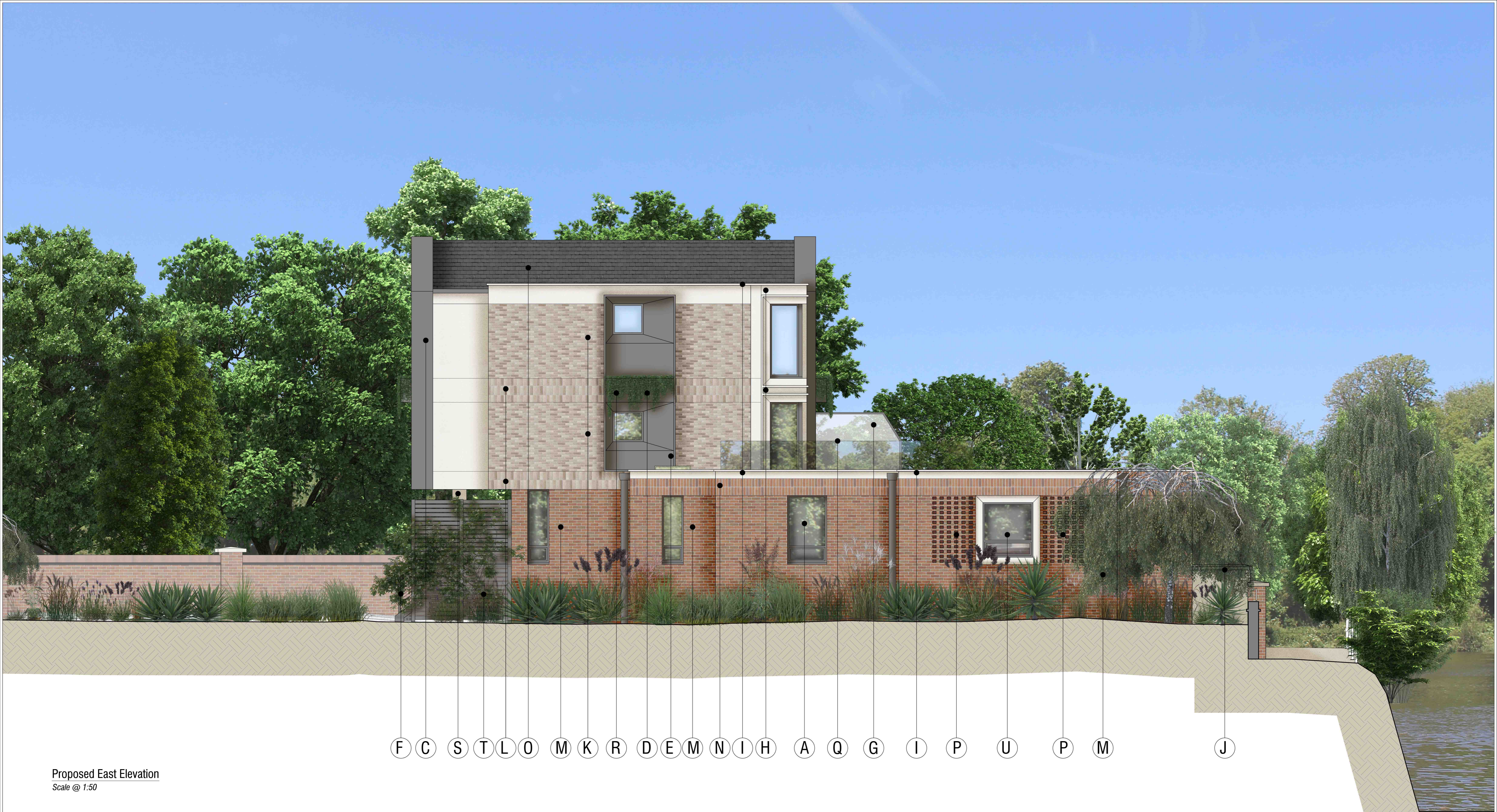
Proposed East Elevation Scale @ 1:50