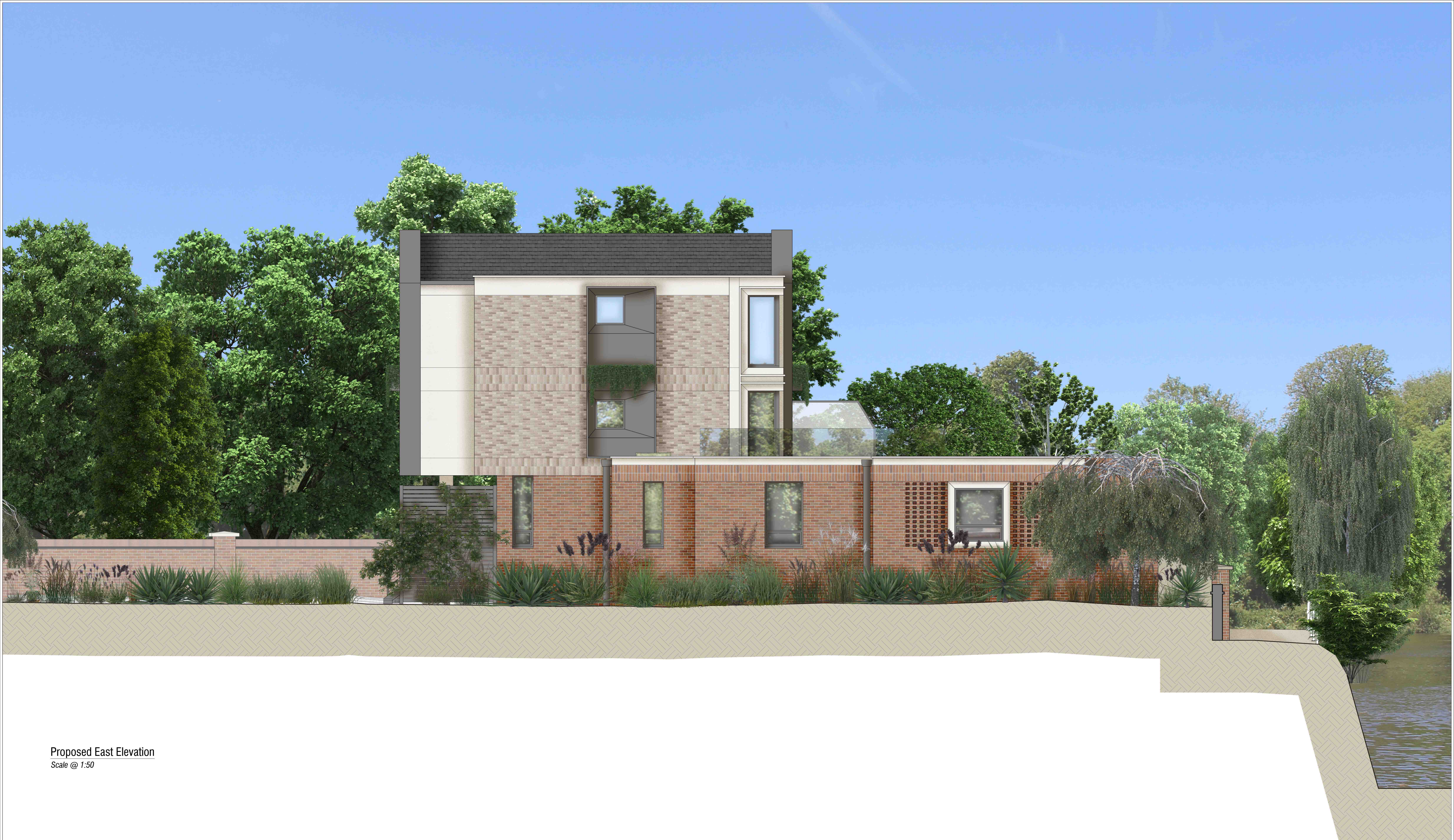
Proposed East Elevation Scale @ 1:50