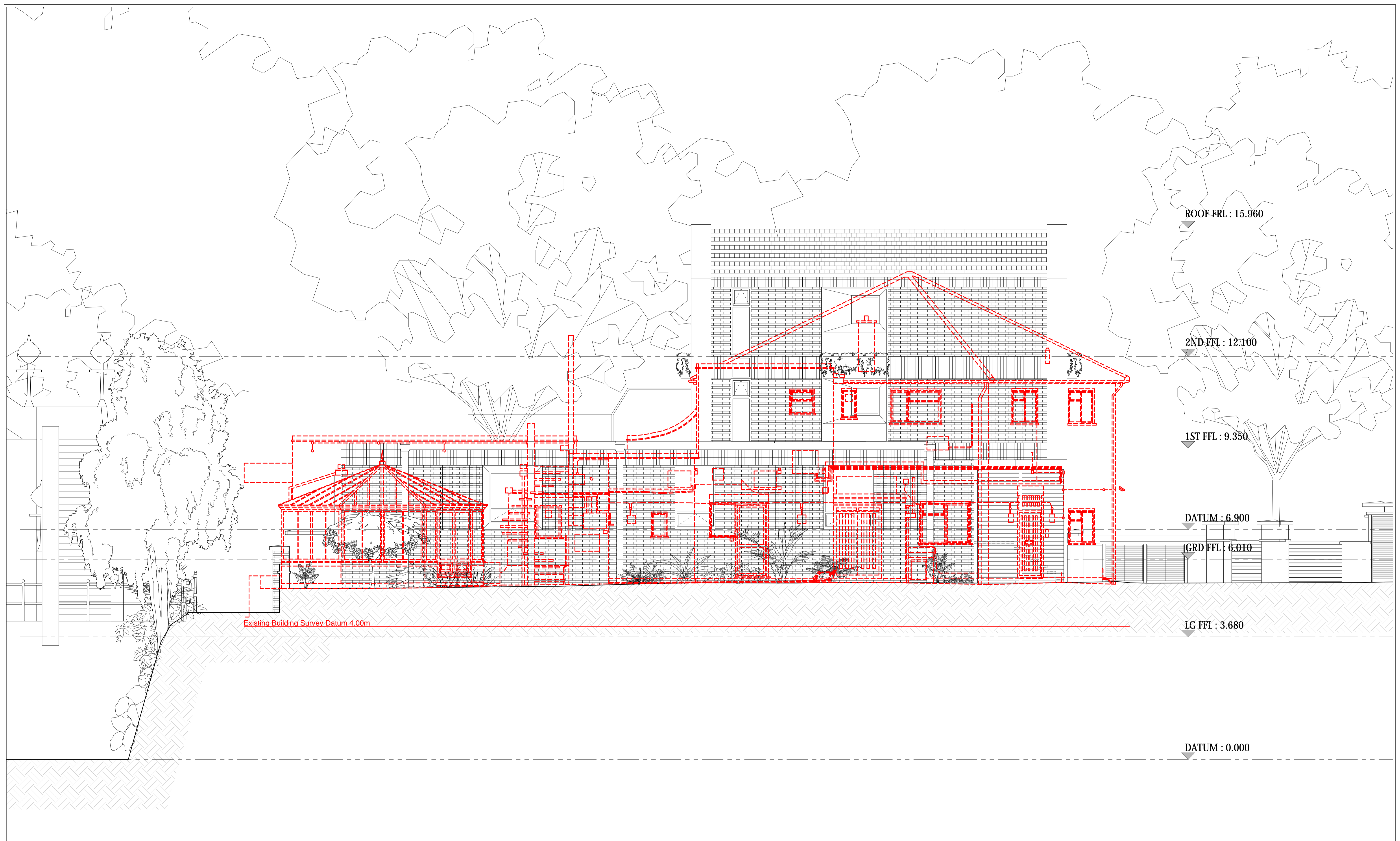
Proposed West Elevation and Existing Elevation Dotted Scale @ 1:50