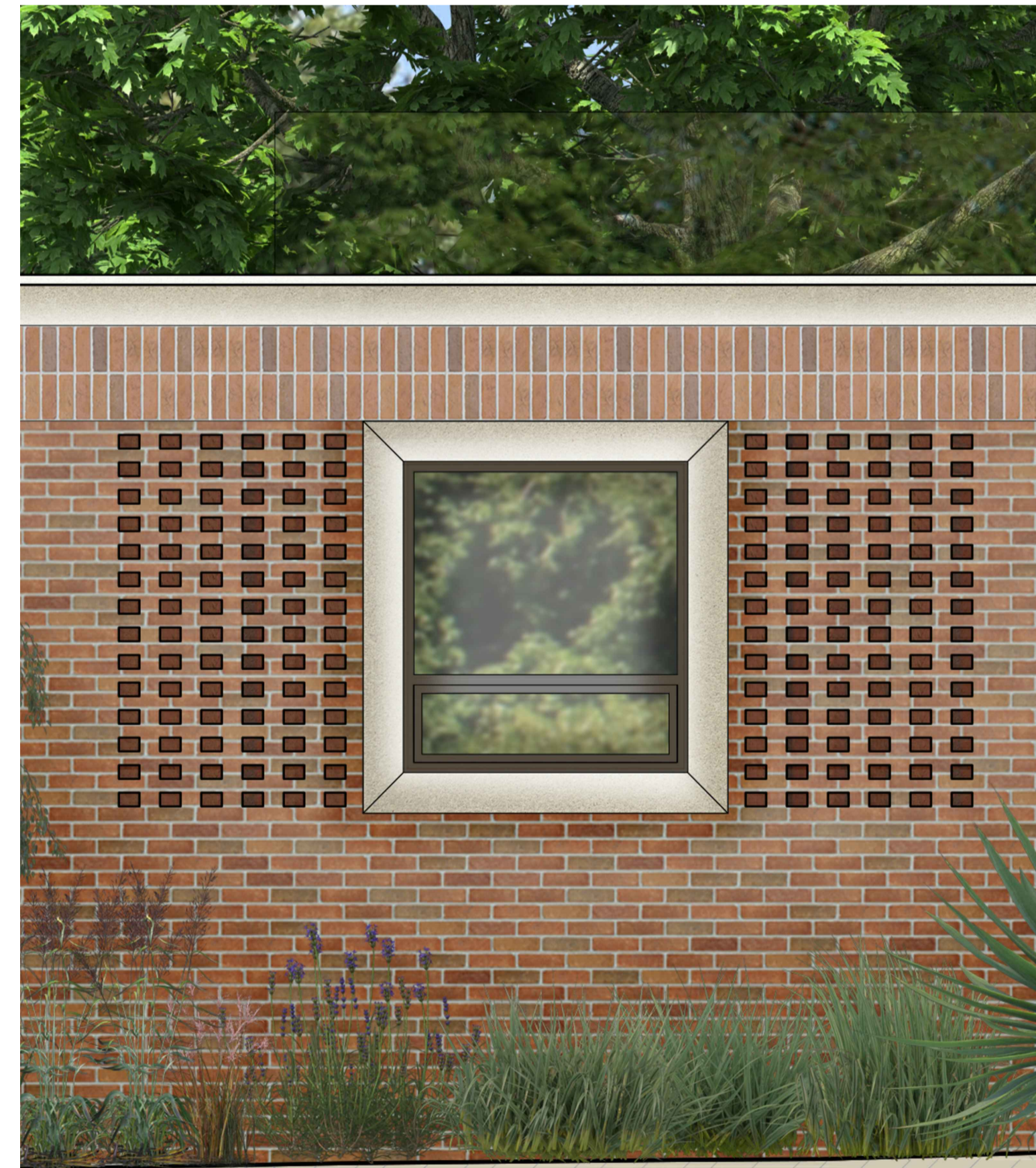
West Elevation Extract

Stone chamfered framed window and cornice reference the Lock Lodge with burnt end bricks either side.