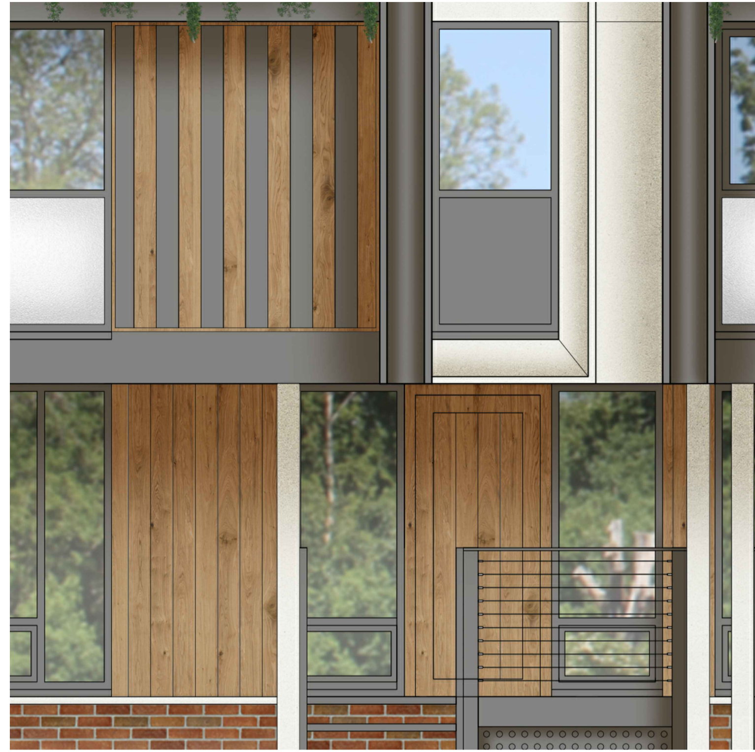
South Elevation Extract

Treated timber louvers and panels are present on the ground floor, first floor and second floor elevations to unify the composition