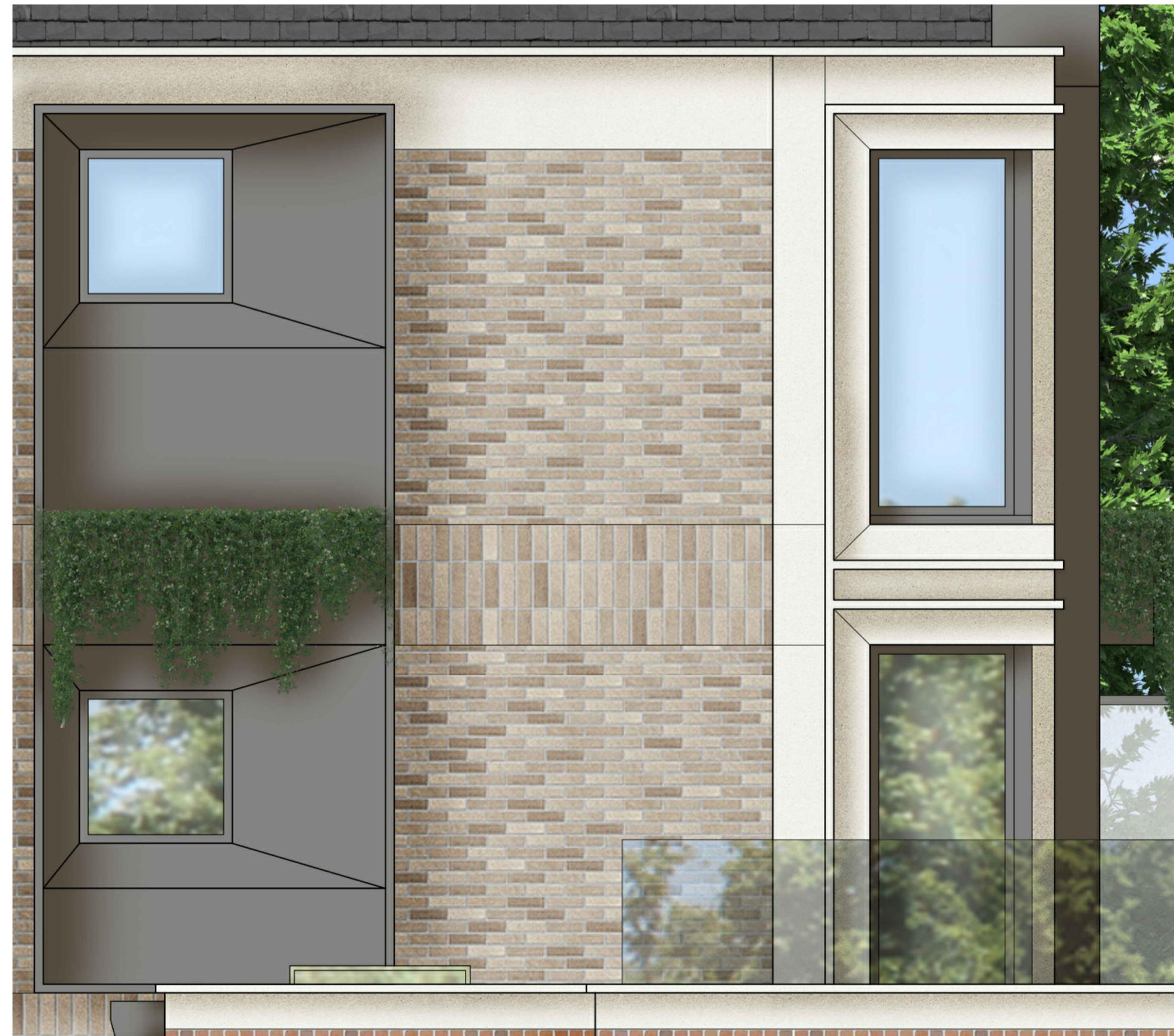
West Elevation Extract