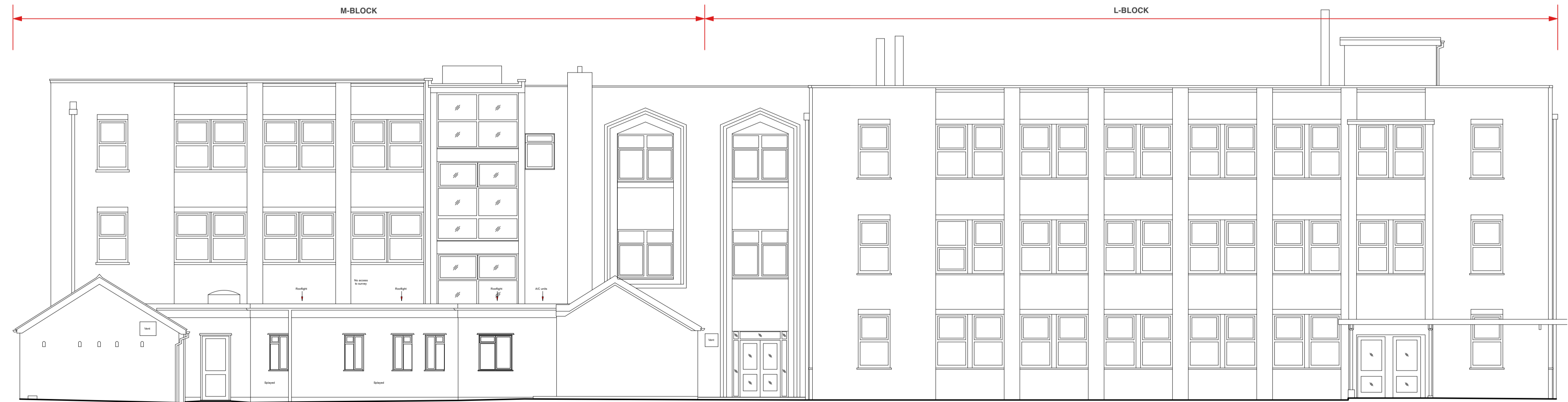
EXISTING EAST ELEVATION scale 1:100