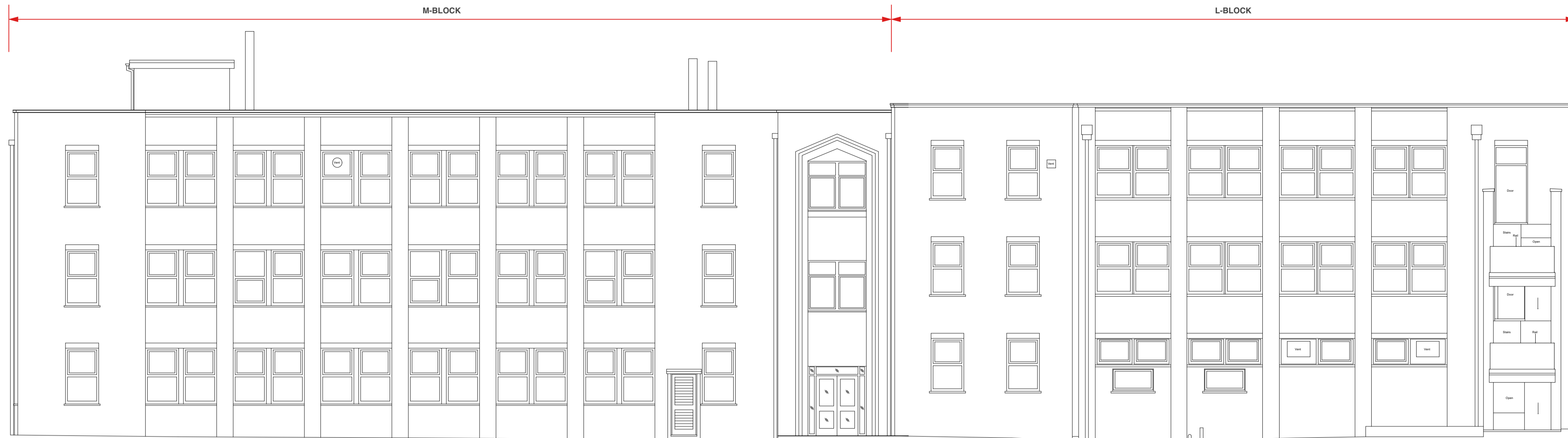
EXISTING WEST ELEVATION scale 1:100