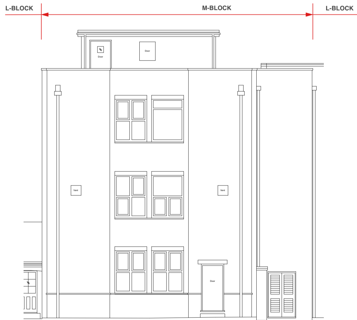
EXISTING NORTH ELEVATION - B scale 1:100