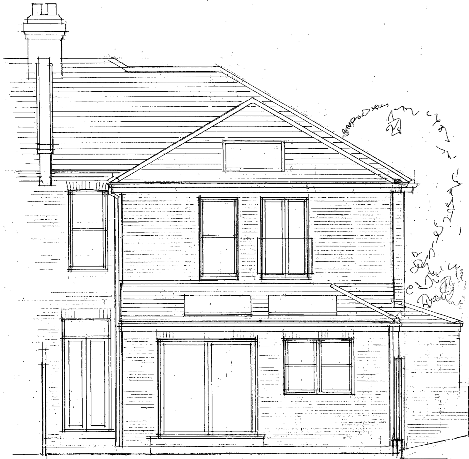
REAR ELEVATION 1:50