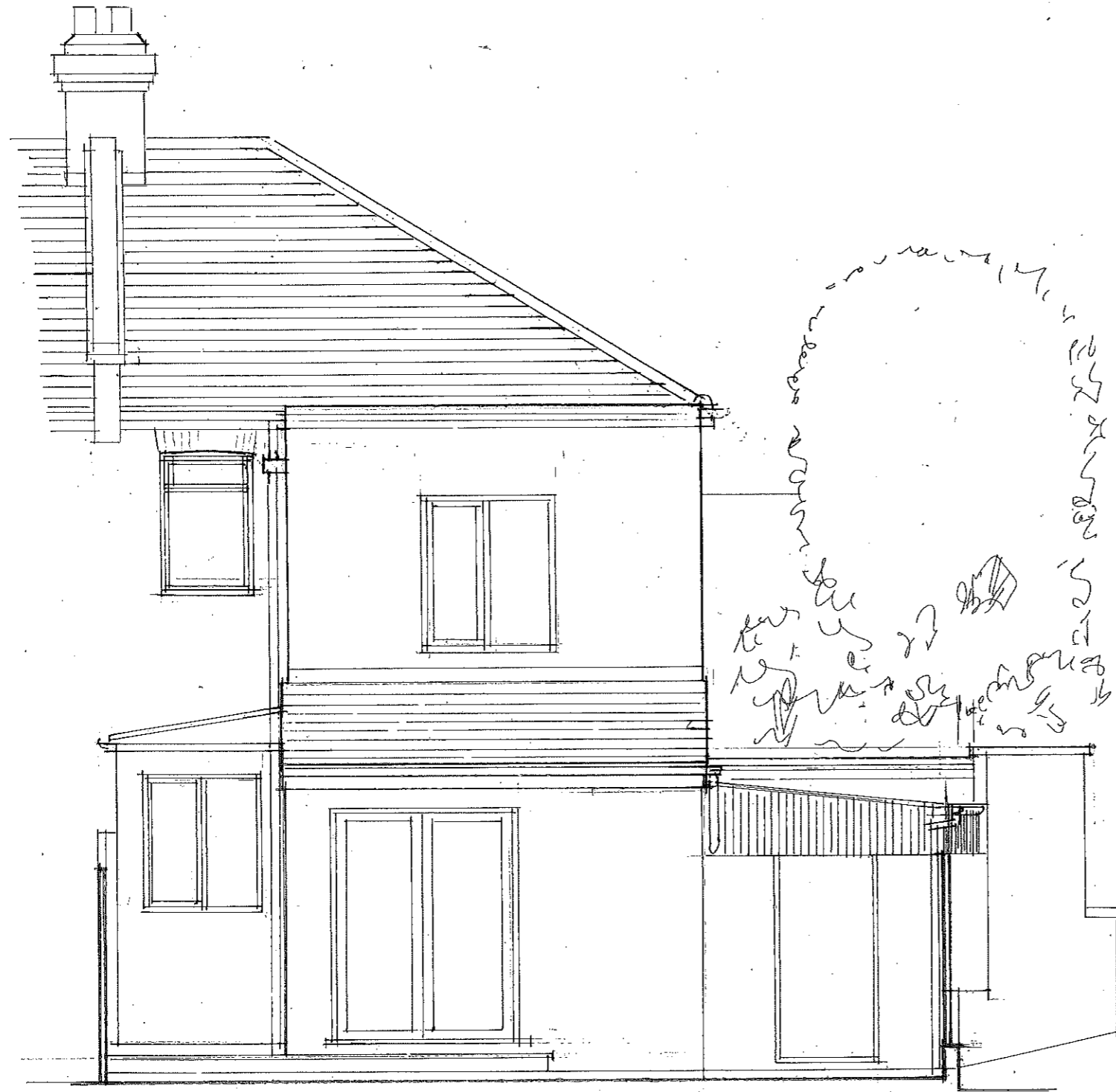
REAR ELEVATION 1:50