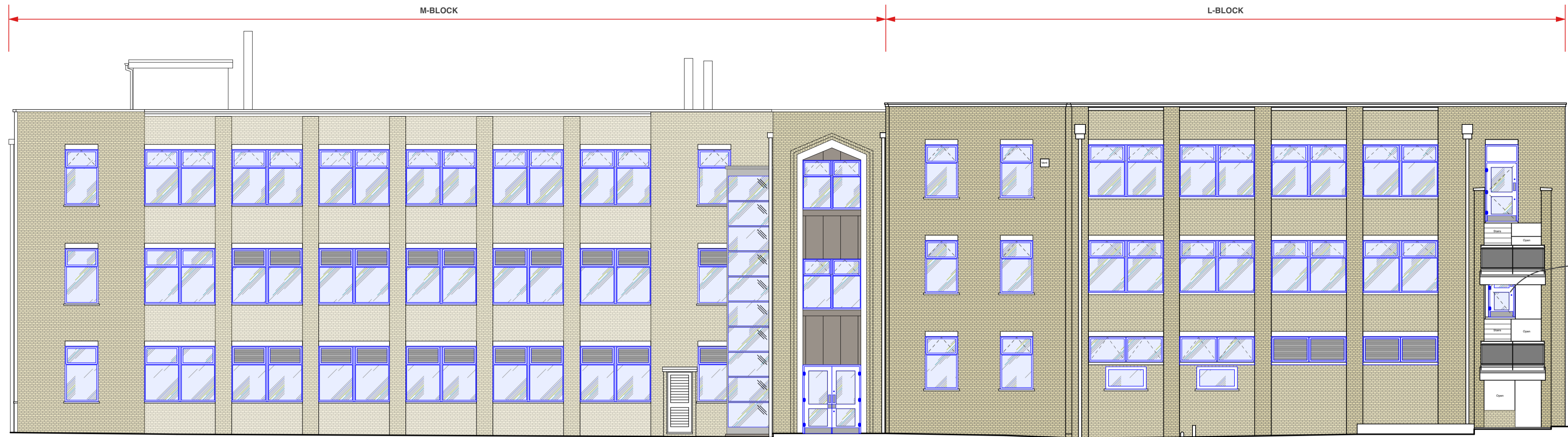
PROPOSED WEST ELEVATION scale 1:100