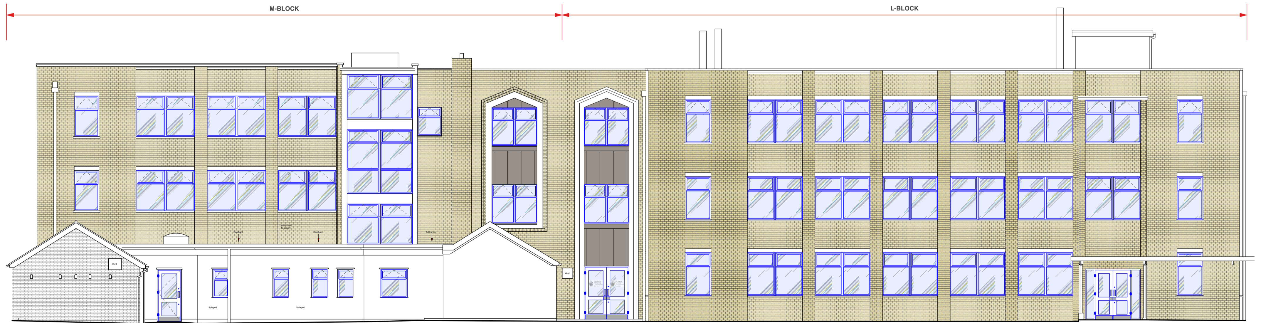
PROPOSED EAST ELEVATION scale 1:100