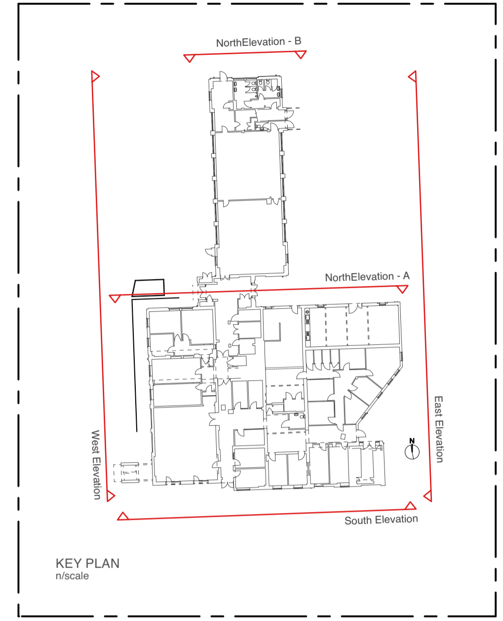
KEY PLAN n/scale