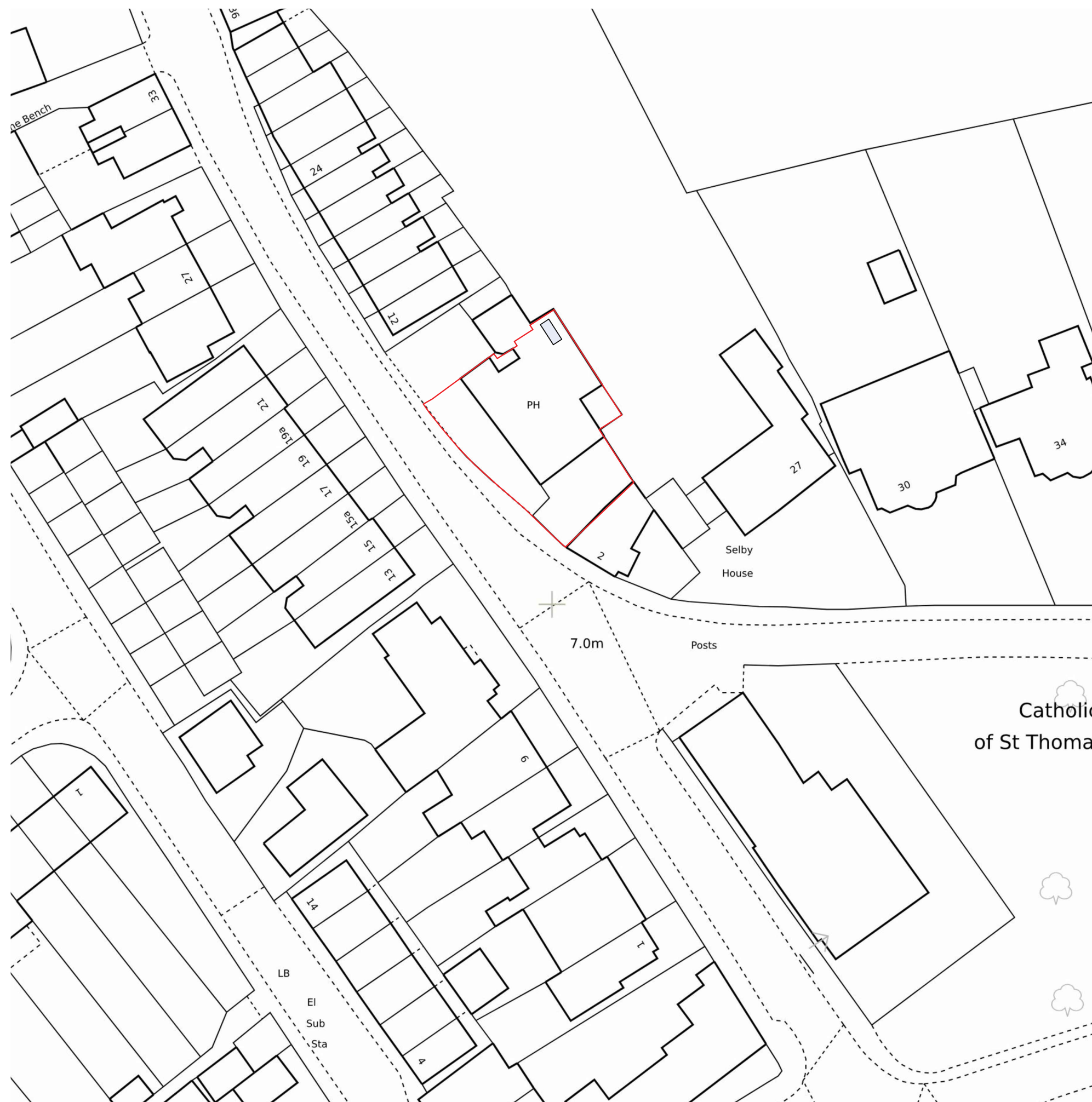
Proposed Block Plan

Block Plans are scaled from the Ordnance Survey Location Maps. Please see the licence number for the Os Maps in the Location Plans