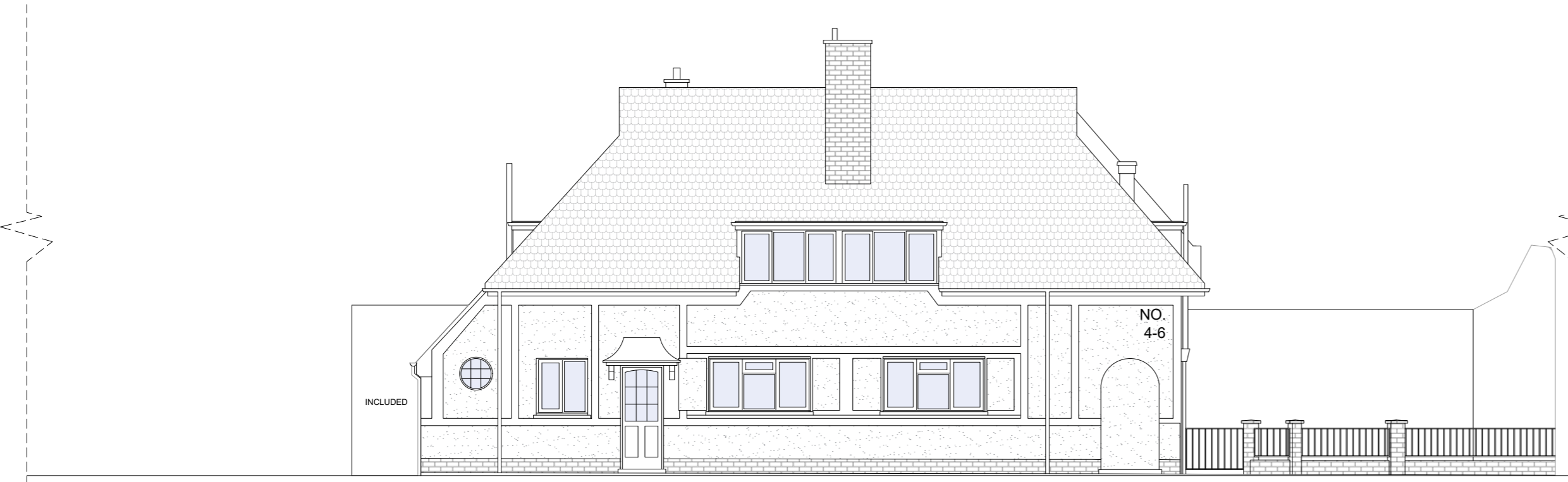
Proposed South Elevation(no change proposed)