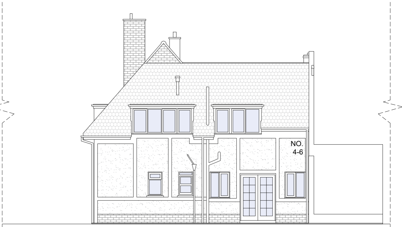
Proposed East Elevation(no change proposed)