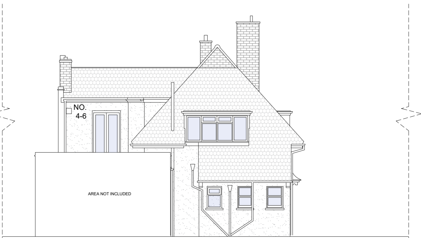
Proposed West Elevation(no change proposed)