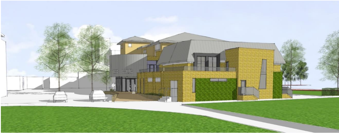
Proposed South End view.