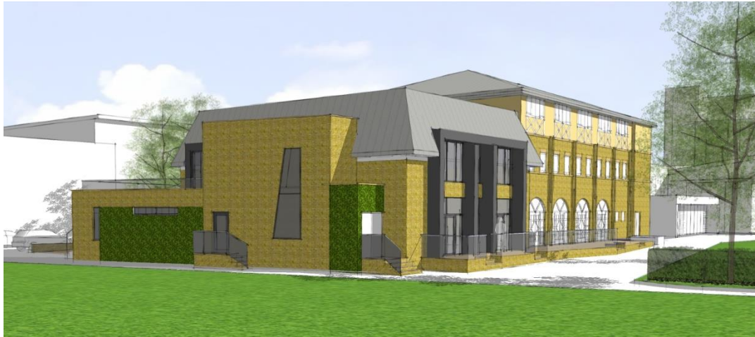
Proposed view facing the running track.