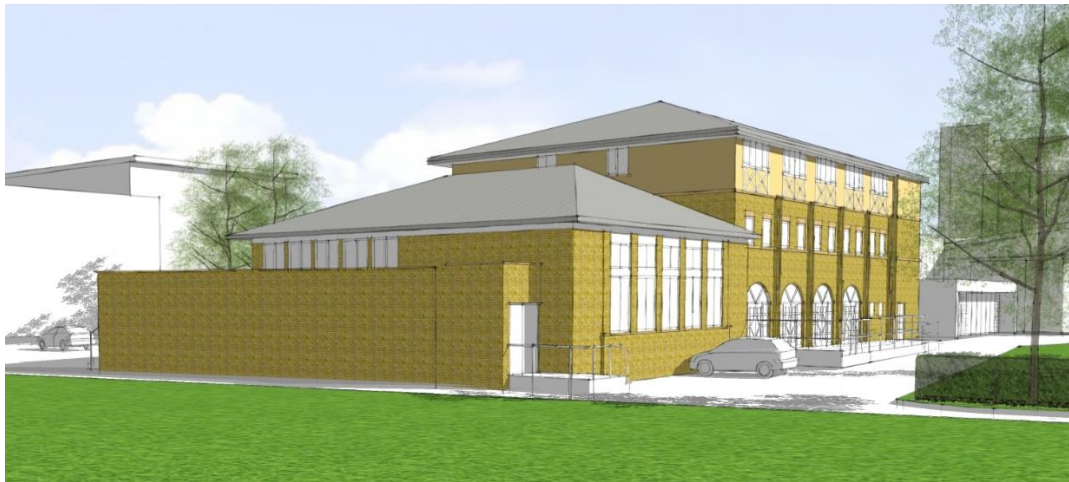
Existing view facing the running track.