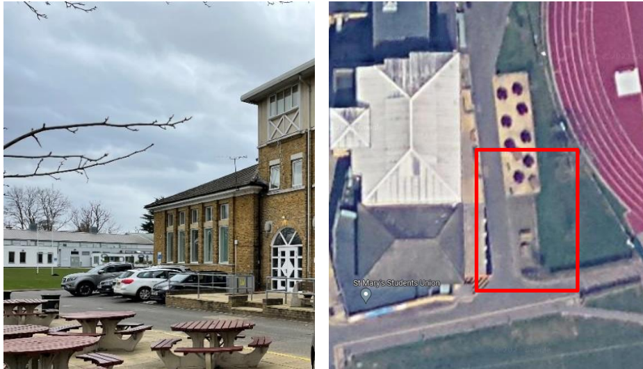
Photos of the existing east facing elevation

As indicated on the planning drawings and 3D visual below, the patio is to be extended across the front of Function Room 1, the new terraced area connects the building to the existing running track, which is considered a sporting facility by being a viewing platform. The patio sits in the MOL, its impact to the MOL is minimal and maintains the nature of the open land. It also provides a visual link to the rest of the Student Heart / Student Lounge and to the open space. Additionally, the terrace forms part of the overall fire strategy by providing alternative means of escape from the main function room.