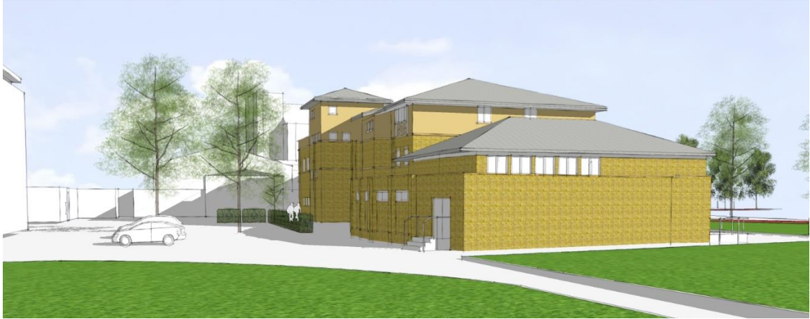
Existing South End view.