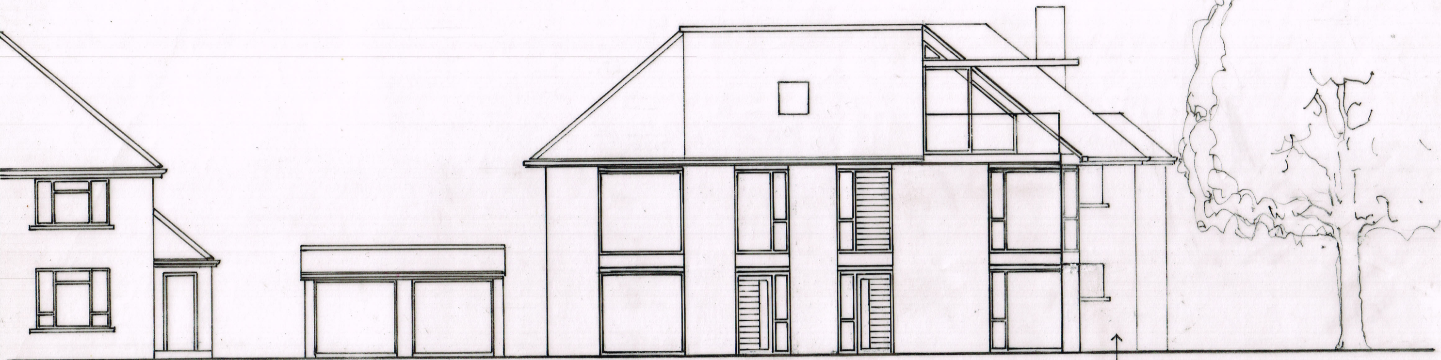
EXISTING MAISONETTES 23-28 ROSELEIGH CLOSE