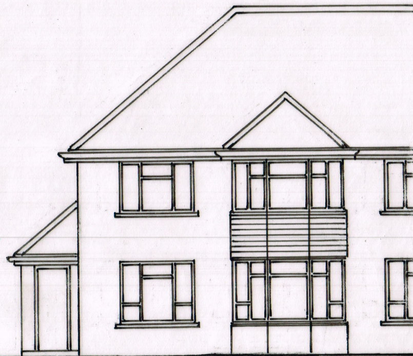
EXISTING MAISONETTES 34 CAMBRIDGE PARK