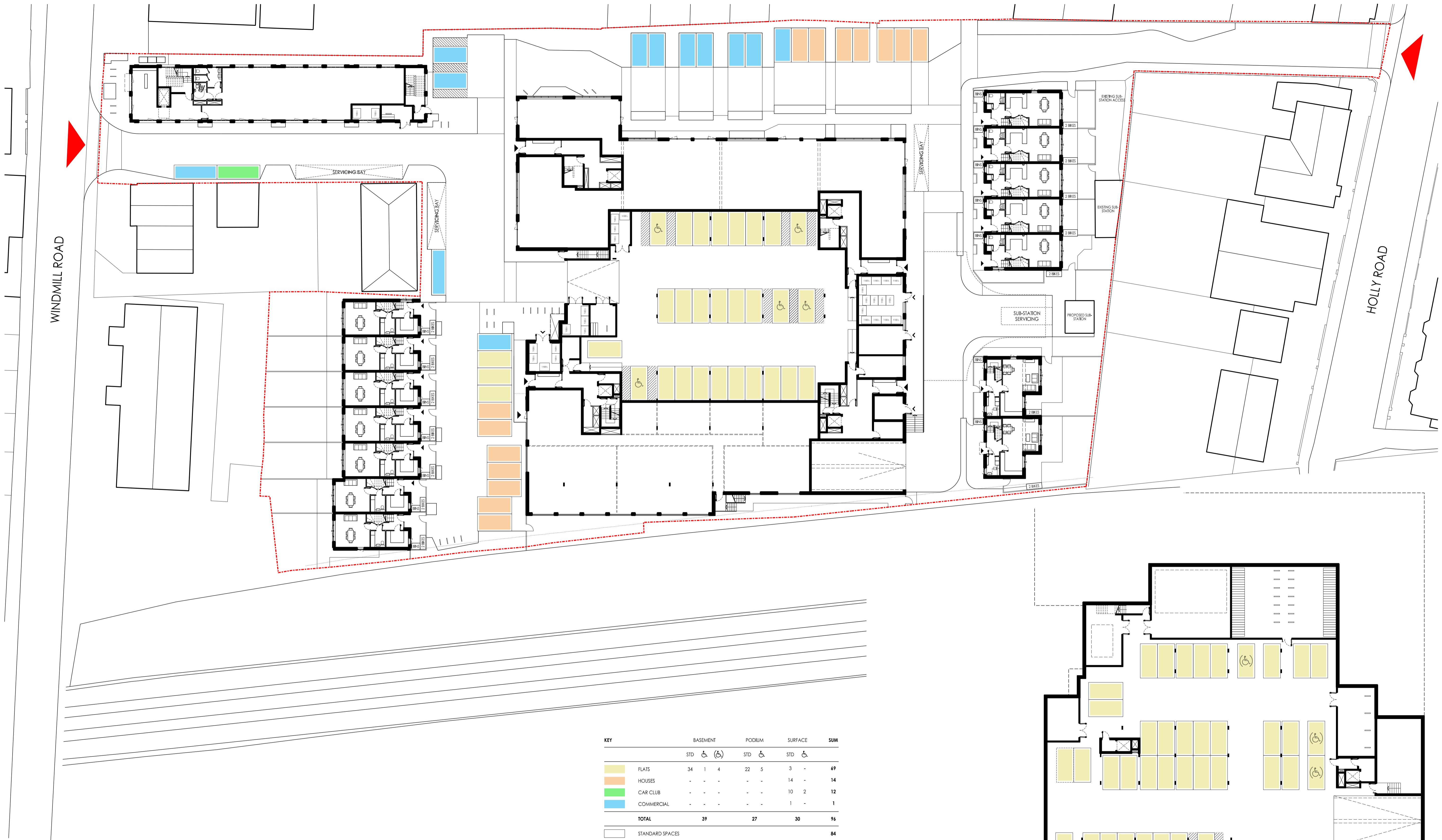
GROUND LEVEL PLAN