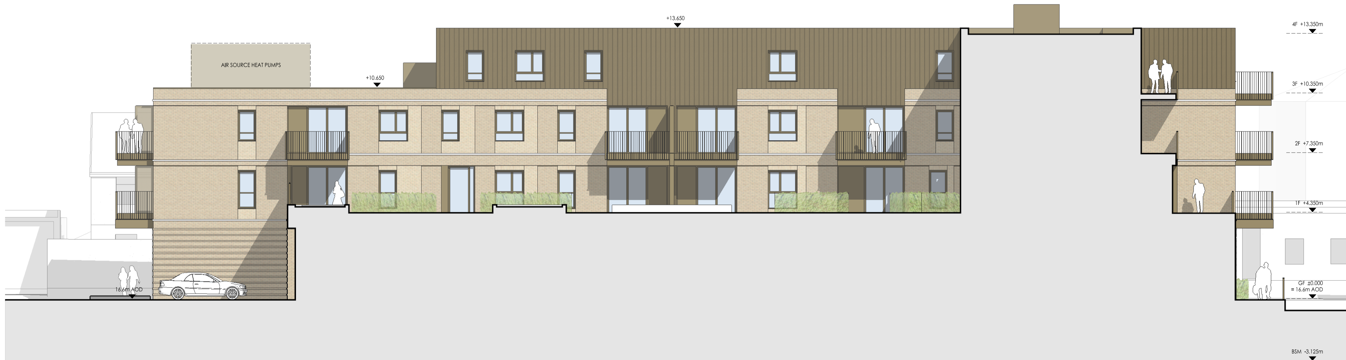
1 BLOCK B1: WEST ELEVATION