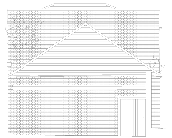
Existing North Elevation