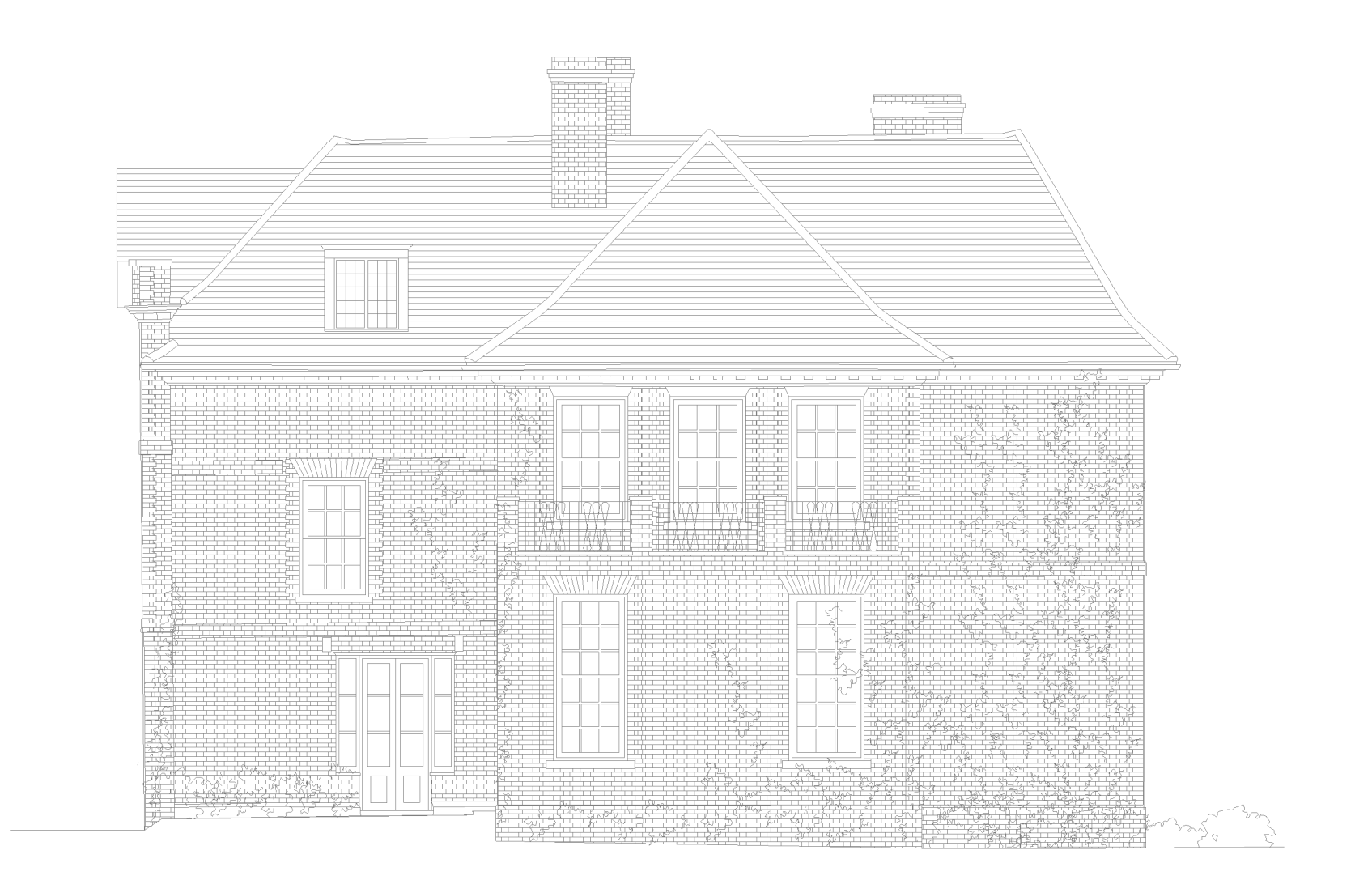
Existing South Elevation