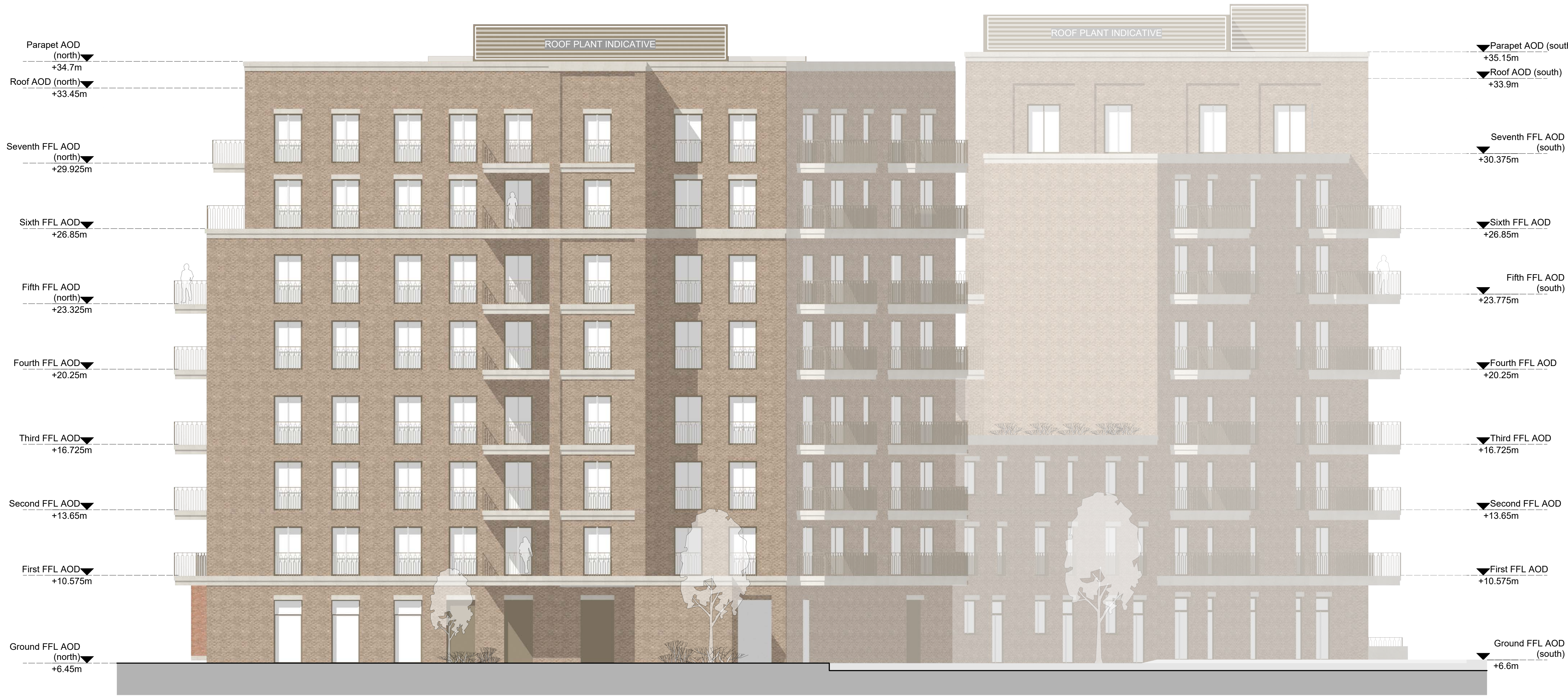
1 Block A North Elevation Scale: 1:100

Assael Architecture Limited 123 Upper Richmond Road London SW15 2TL +44 (0)20 7736 7744 info@assael.co.uk www.assael.co.uk