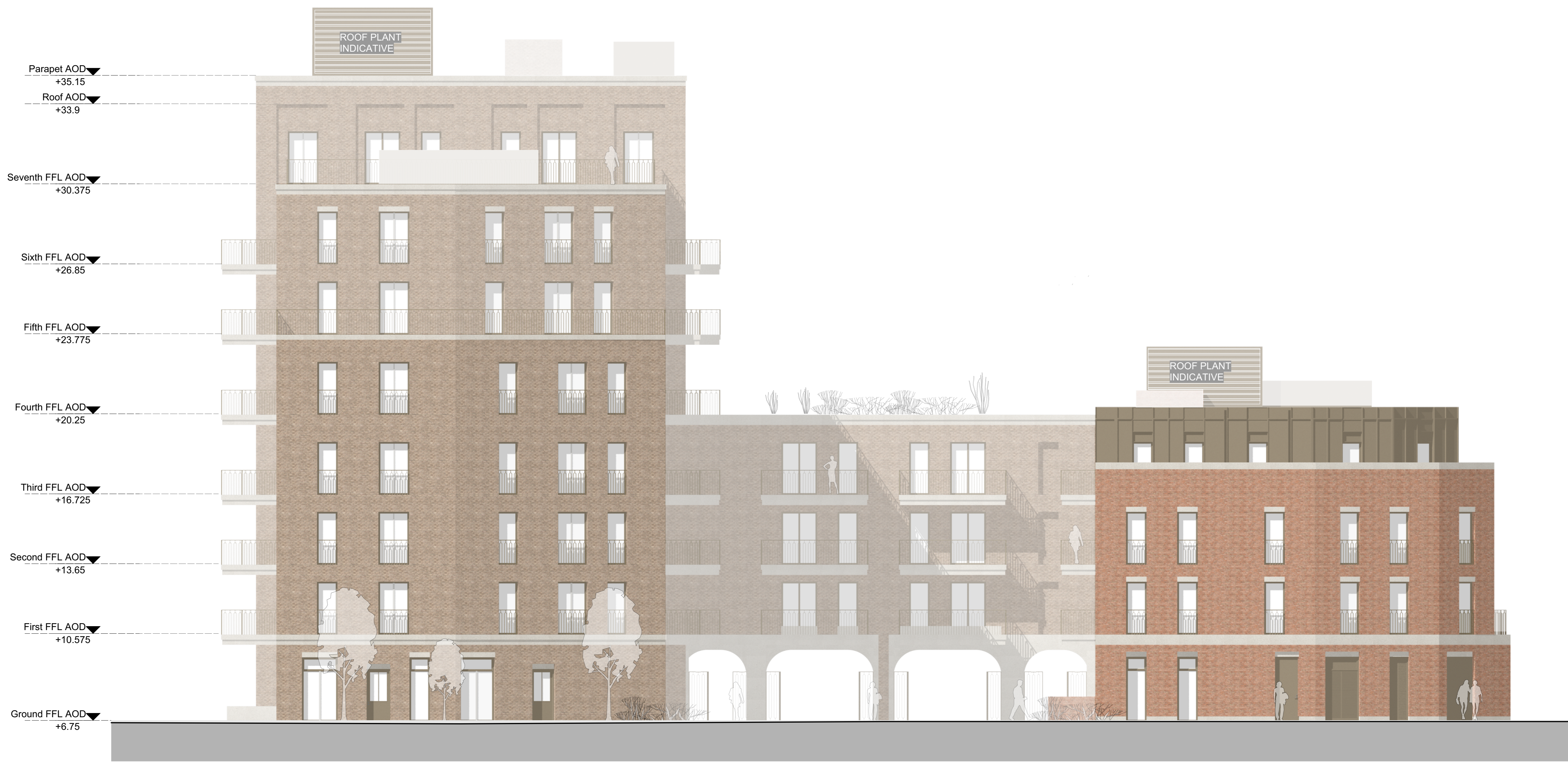
3 Block D South Elevation Scale: 1:100