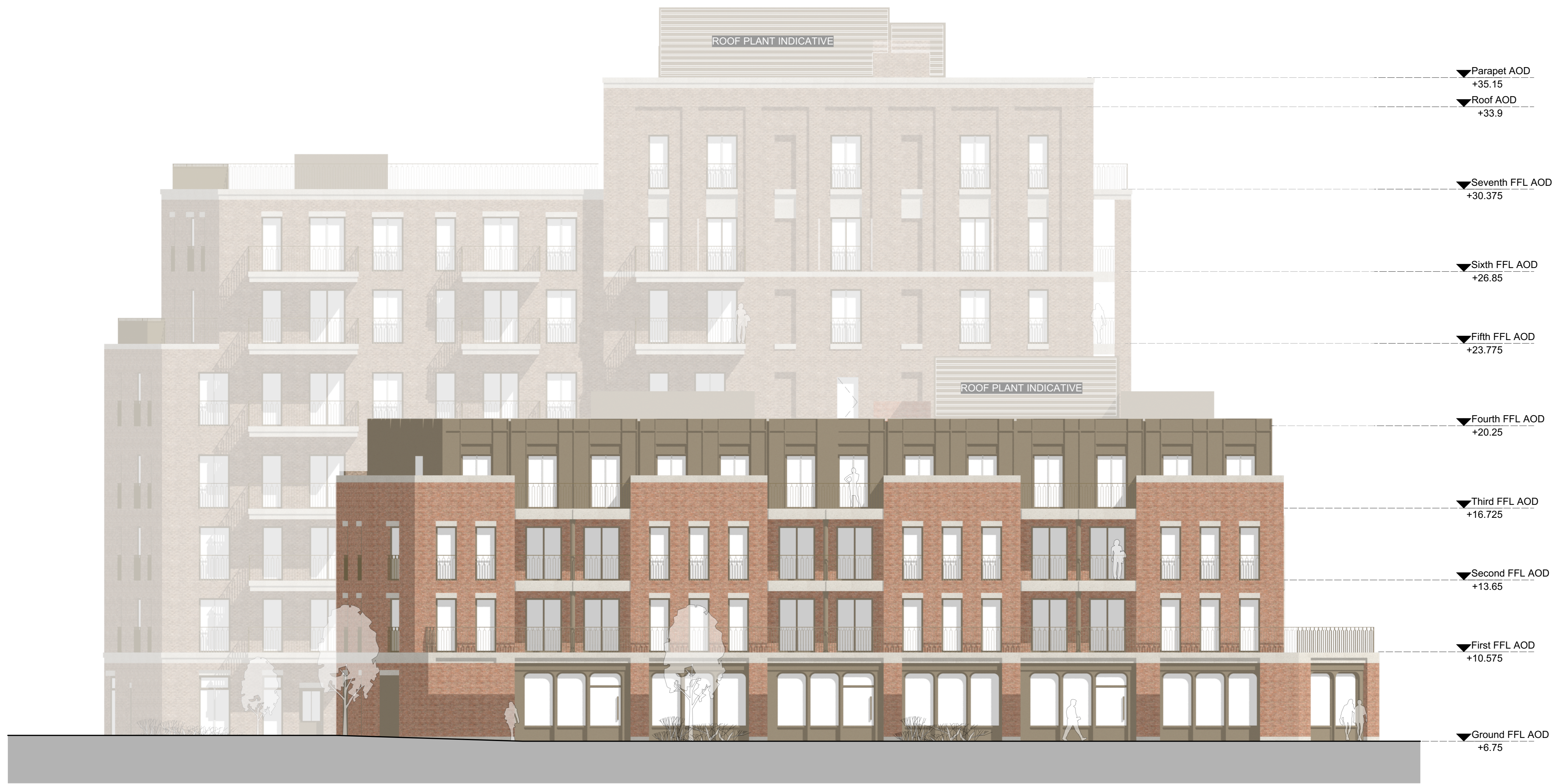
2 Block D East Elevation Scale: 1:100