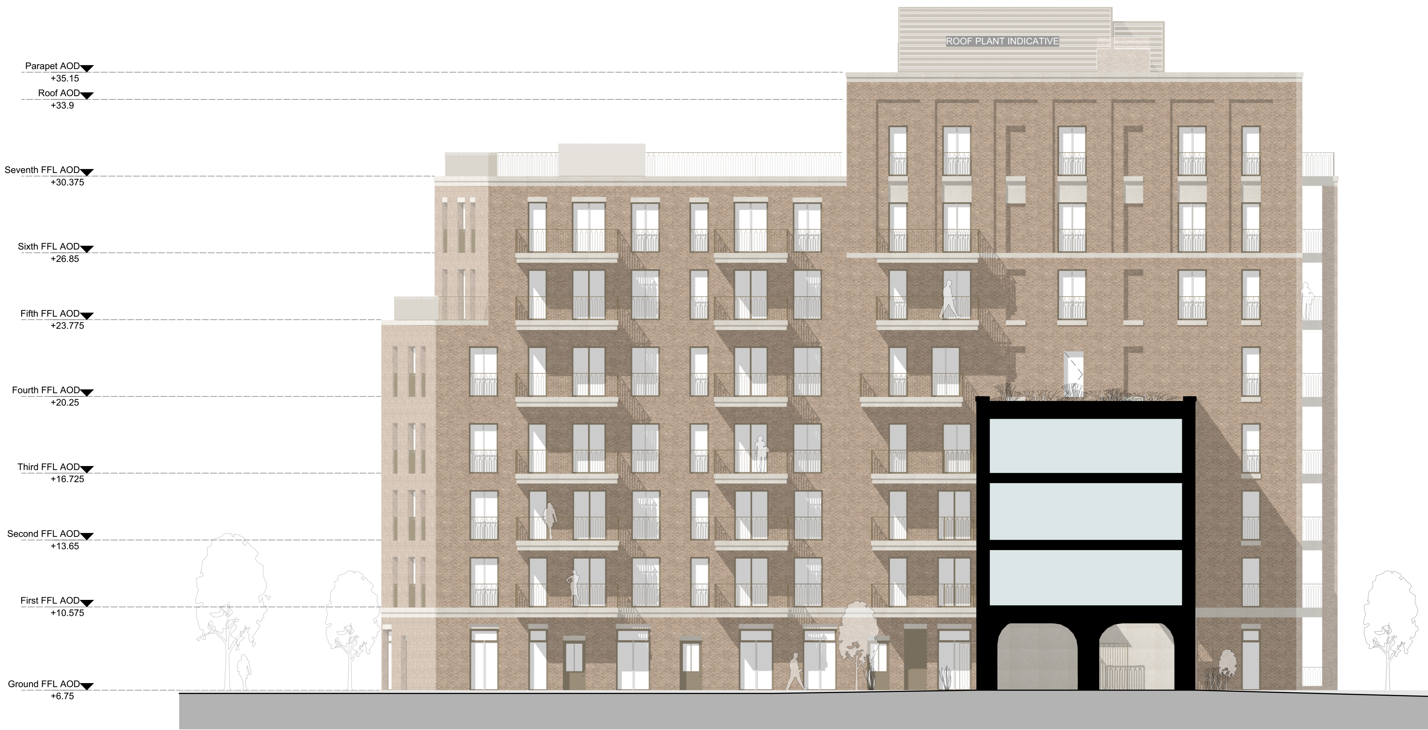
6 Block D East Internal Courtyard Elevation Scale: 1:100