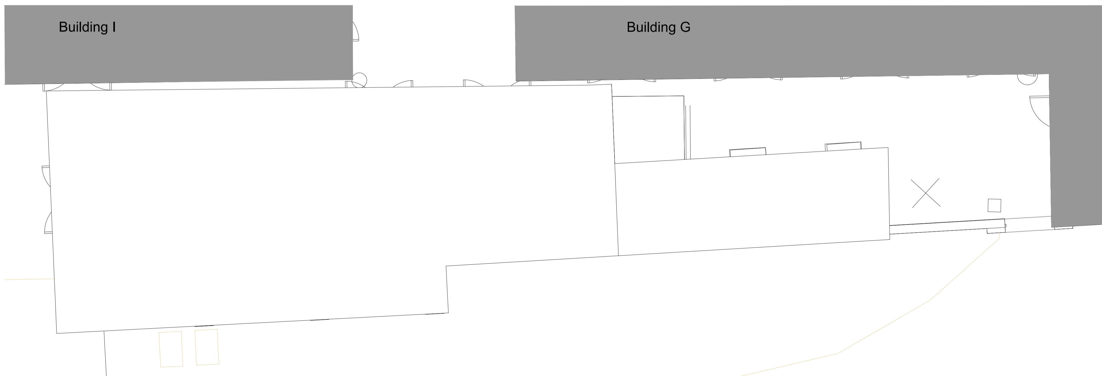
2 ROOF PLAN - BUILDING H SCALE - 1:50 @ A1