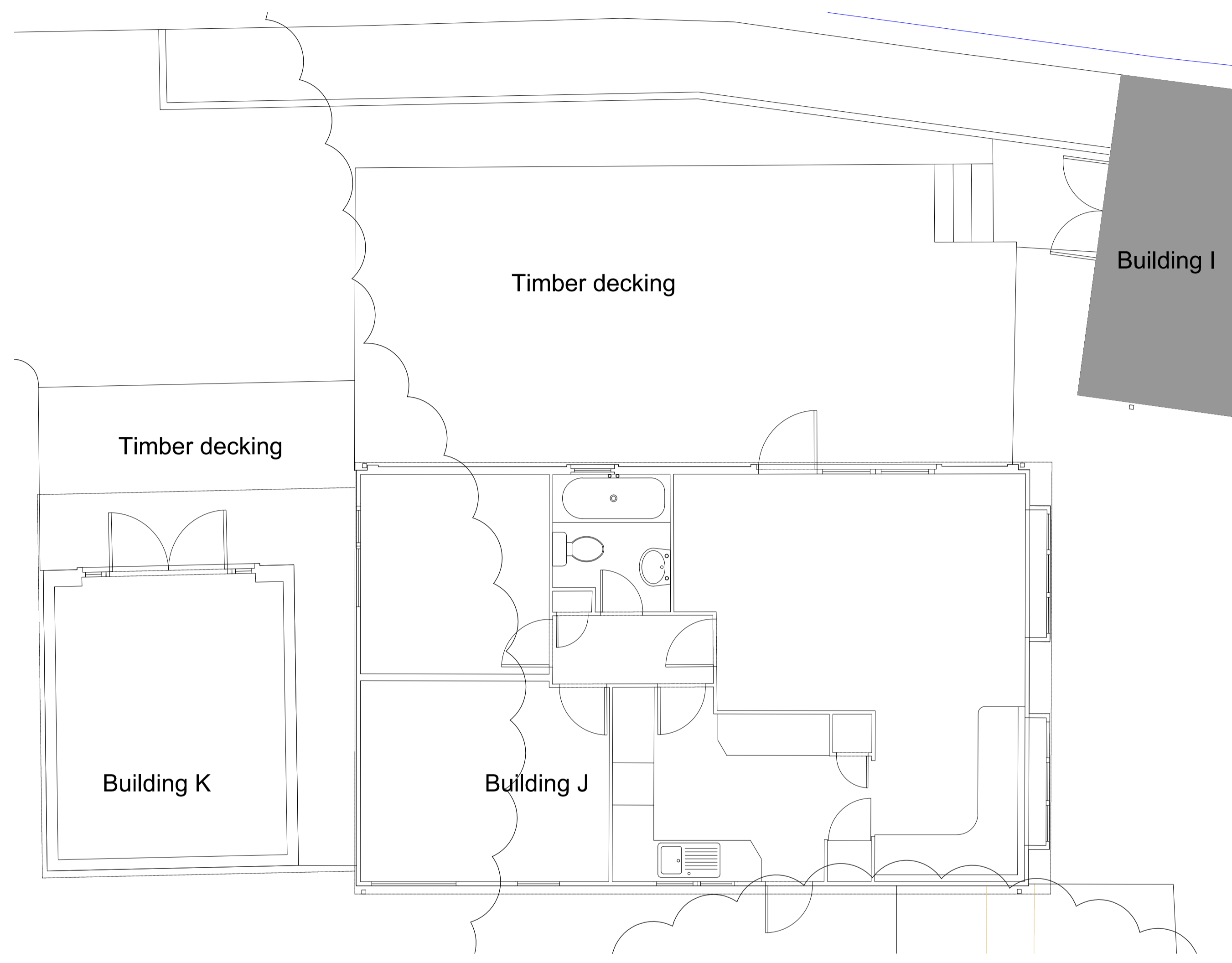
1 FLOOR PLAN - BUILDING J&K SCALE - 1:50 @ A1