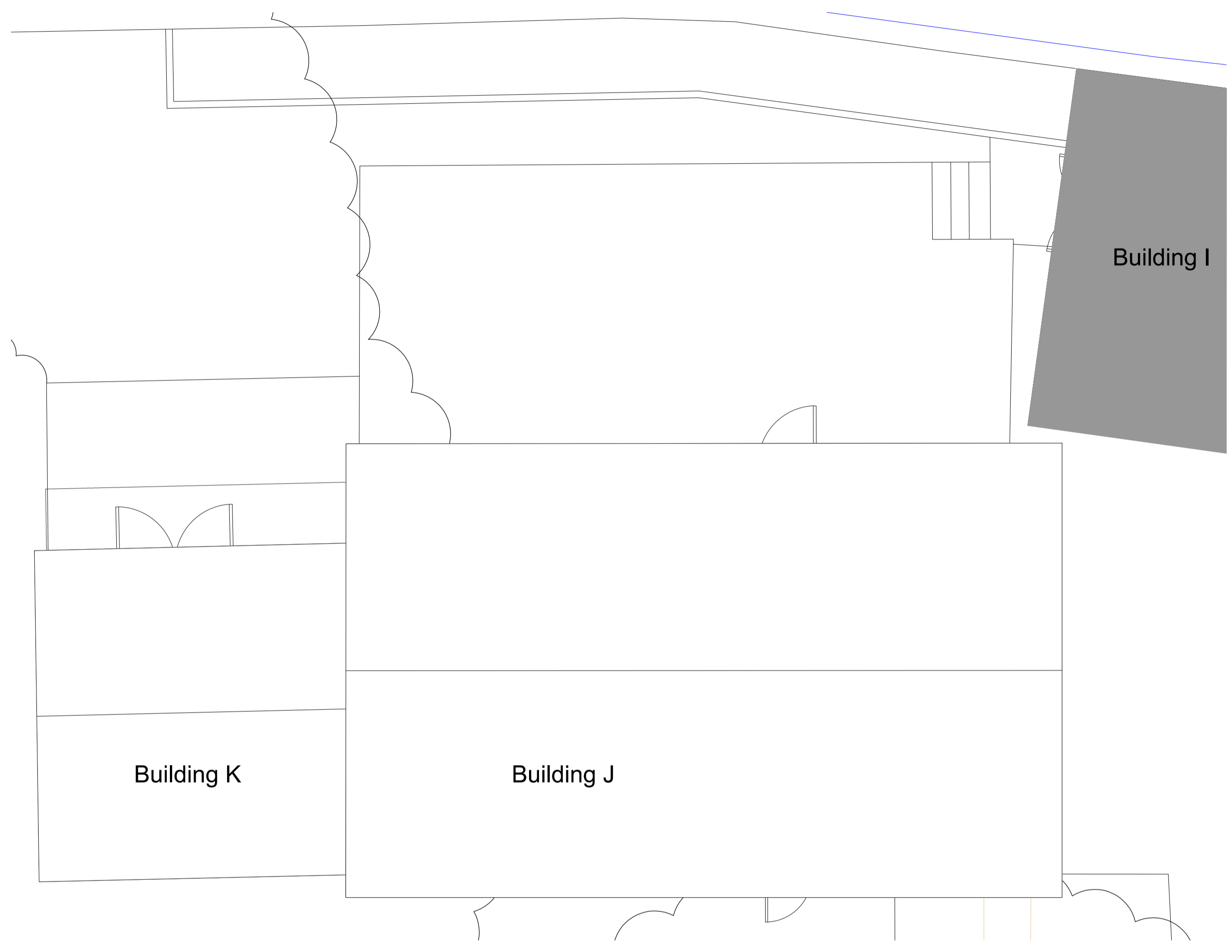
1 ROOF PLAN - BUILDING J&K SCALE - 1:50 @ A1