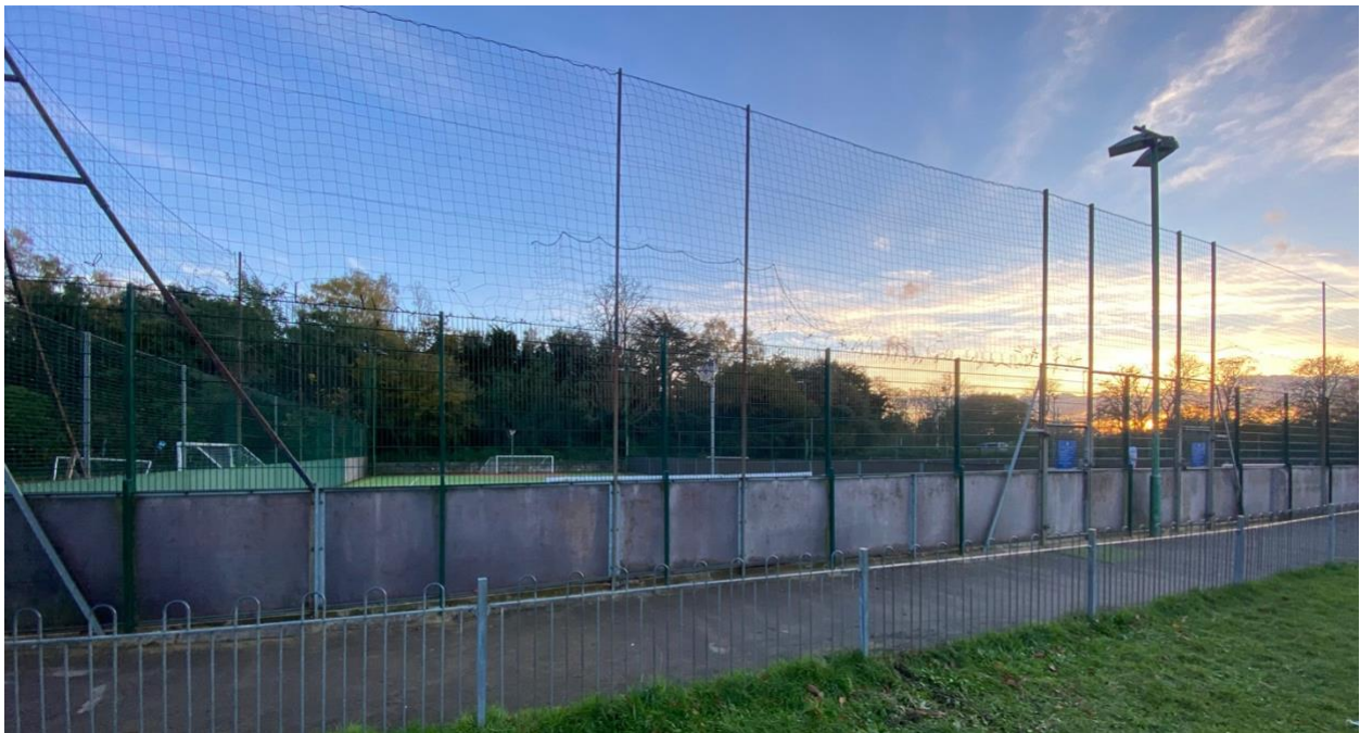
View of the proposal site