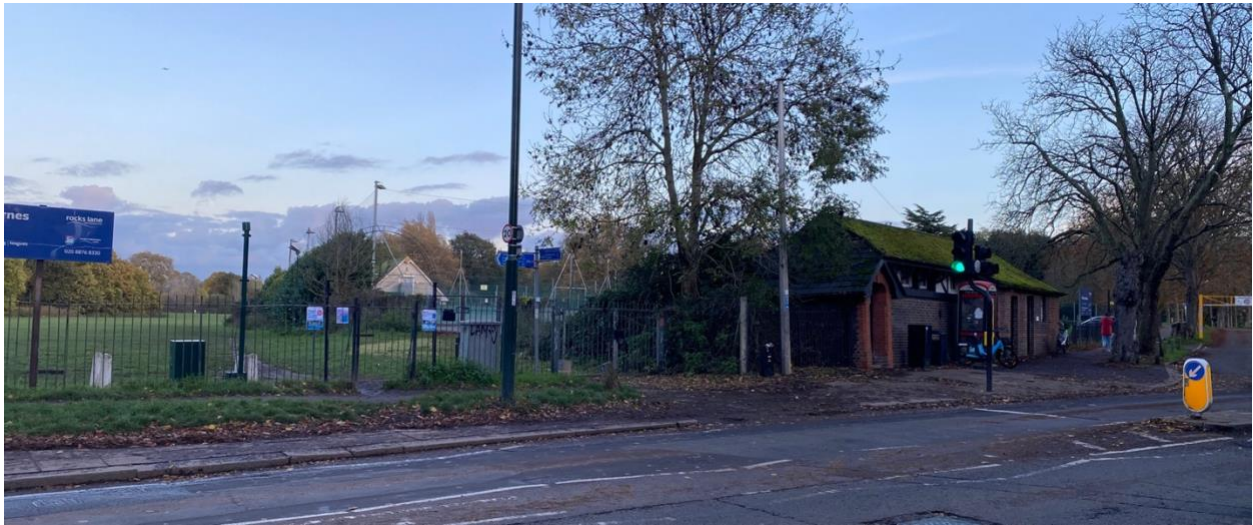
View from Rocks Lane