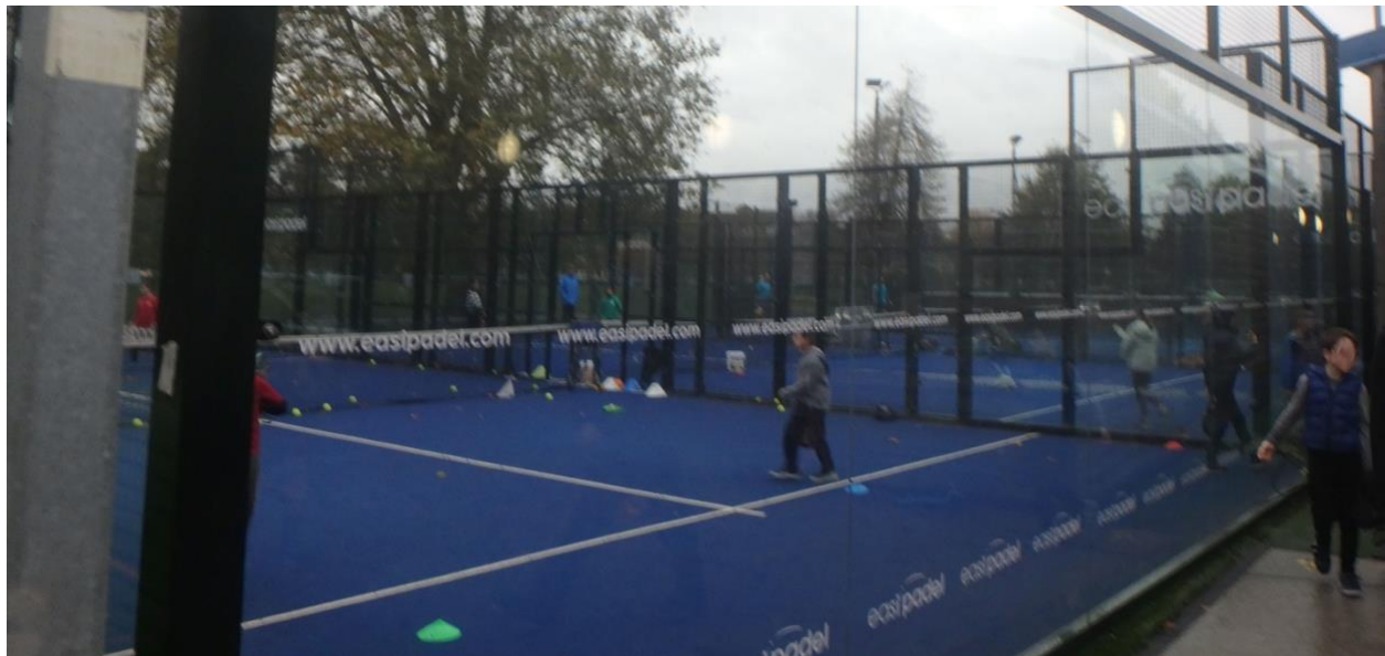
Chiswick centre padel tennis courts.

2.7 There are no existing padel tennis courts at the Barnes centre, but there are 10 courts at the Chiswick centre which are proving very popular with the local community. They were opened at the beginning of October 2020 and provide casual play, coaching and competition for all.