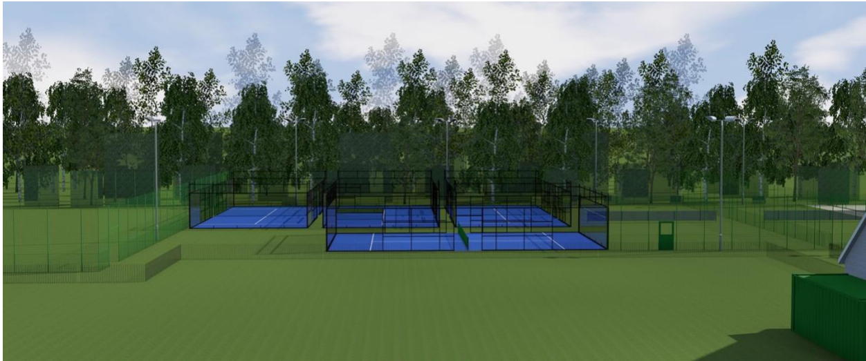
Computer generated image of the proposal

4.3 The surface will be as existing, which is porous macadam on a crushed stone base with sub surface drainage.