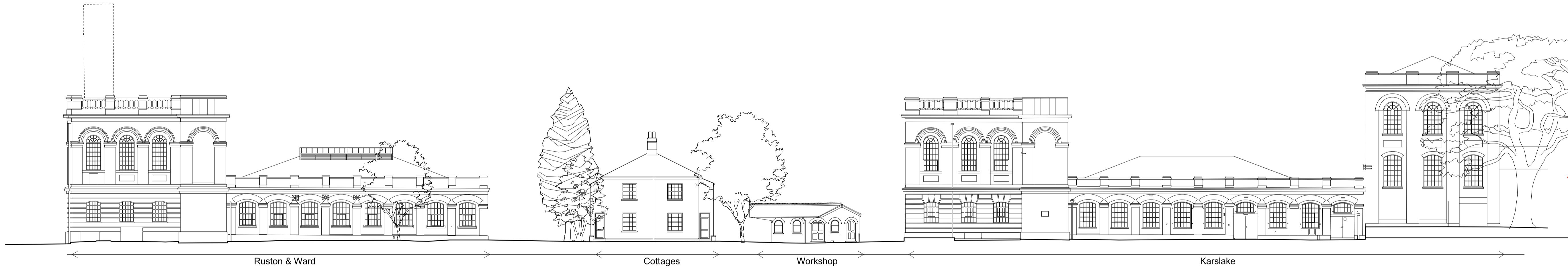
SCALE 1:200 SITE ELEVATION - North, street - Existing