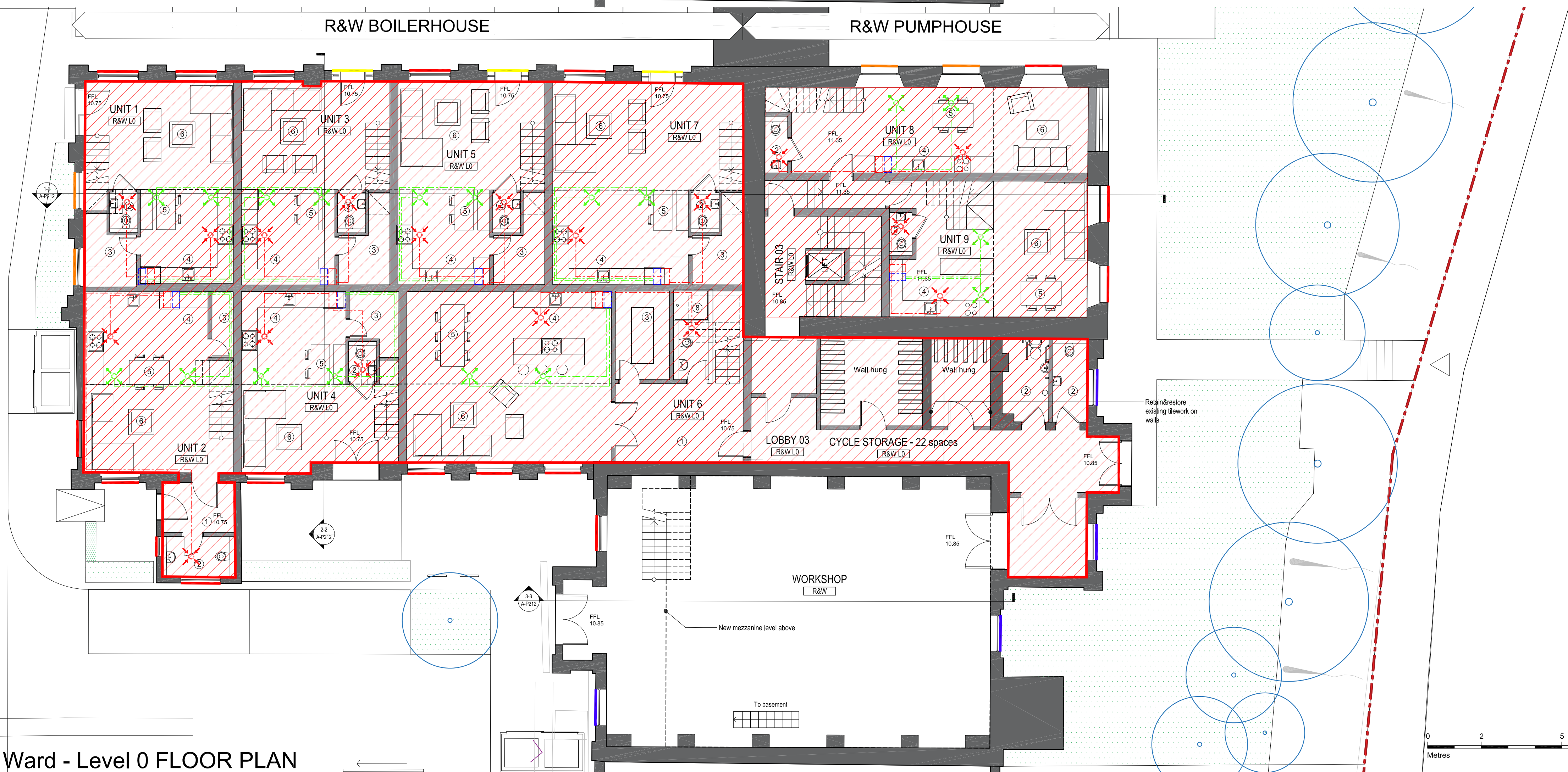
SCALE 1:100 Ruston & Ward - Level 0 FLOOR PLAN

USE OF DRAWINGS DO NOT SCALE FROM THIS DRAWING. USE WRITTEN DIMENSIONS AND CHECK ON SITE. THIS DRAWING IS BASED ON SITE INFORMATION SUPPLIED BY THIRD PARTIES AND ACCURACY OF EXISTING FEATURES IS NOT GUARANTEED. ANY ERROR, OMISSION OR DISCREPANCY NOTED ON OR BETWEEN DRAWINGS AND OTHER DOCUMENTS MUST BE REPORTED IN WRITING IMMEDIATELY. ALL MECHANICAL, ELECTRICAL AND STRUCTURAL LAYOUTS / COMPONENTS ARE INDICATIVE AND MUST BE DESIGNED AND CHECKED BY SPECIALISTS. DO NOT START WORK ON SITE BEFORE CONFIRMING THAT ALL NECESSARY STATUTORY AND OTHER CONSENTS HAVE BEEN OBTAINED. THIS DRAWING IS COPYRIGHT AND MUST NOT BE DISTRIBUTED WITHOUT PERMISSION. ELECTRONIC CAD FILES MUST NOT BE ALTERED OR COPIED.