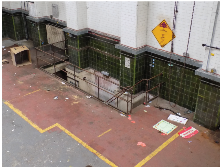
Figure 33: Ruston & Ward Building, 1932 steps and handrail to basement in former Ruston engine house (originally Sheffield's Boiler House) (low significance)