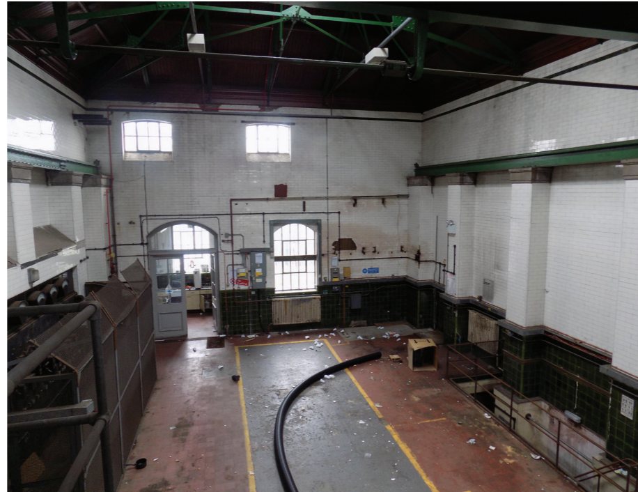
Figure 31: Ruston & Ward Building, general view of interior of former Ruston engine house (originally Sheffield's Boiler House), showing former location of 1932 Ruston diesel generator set