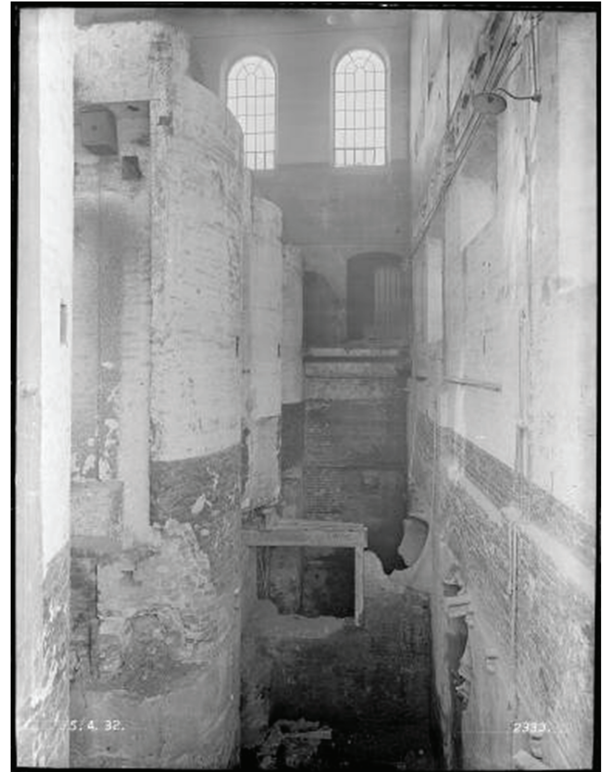
Figure 29 B: 1932 image of the Ruston Bull engine house at Hampton, following removal of the three engines, prior to the removal of the substantial brick engine bases over the pumping wells