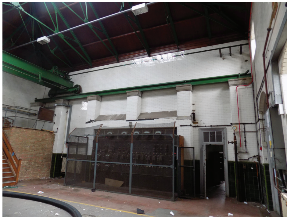
Figure 34: Ruston & Ward Building, damaged electrical control panel in former Ruston engine house (originally Sheffield's Boiler House) (low to medium significance)