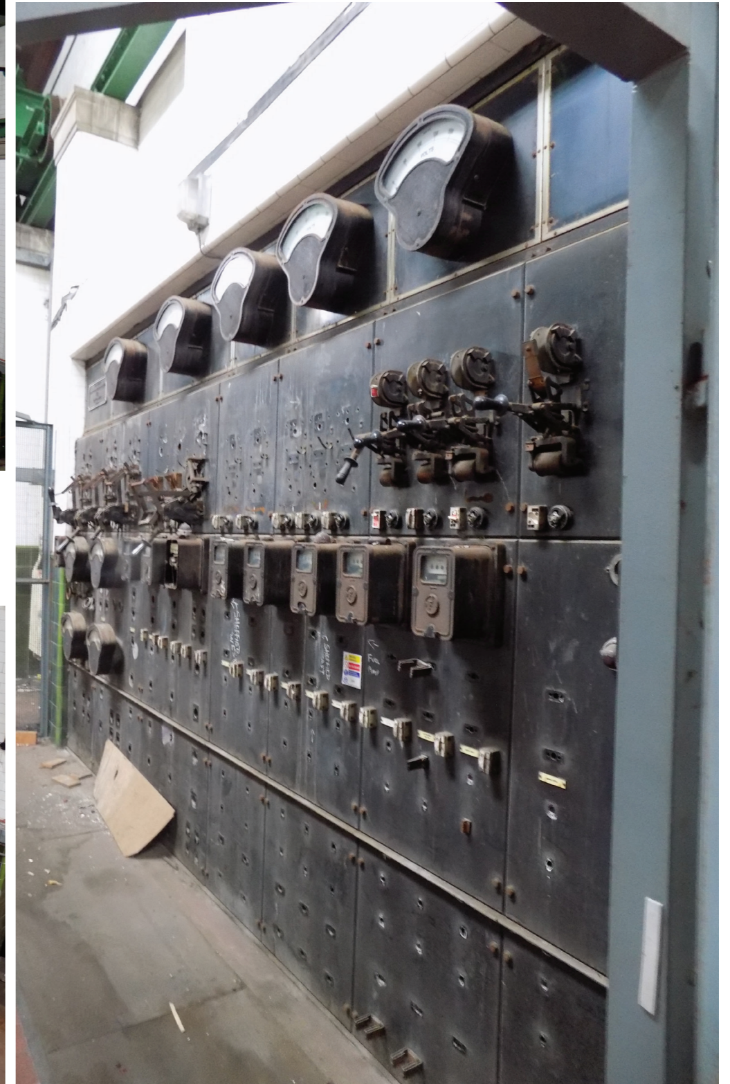
Figure 32: Ruston & Ward Building, damaged electrical control panel in former Ruston engine house (originally Sheffield's Boiler House) (low to medium significance)