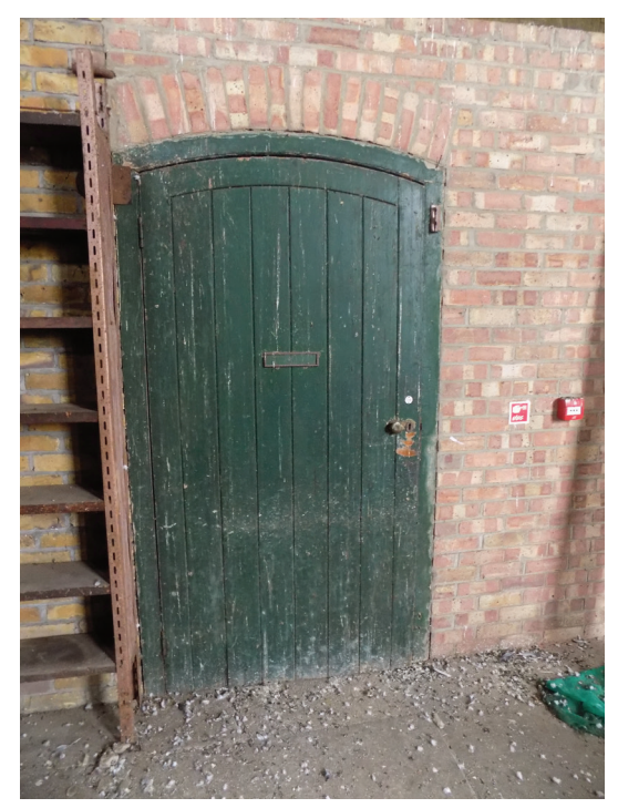
Figure 90: Re-located primary door on middle mezzanine (cylinder) floor (see Figure 81 above)