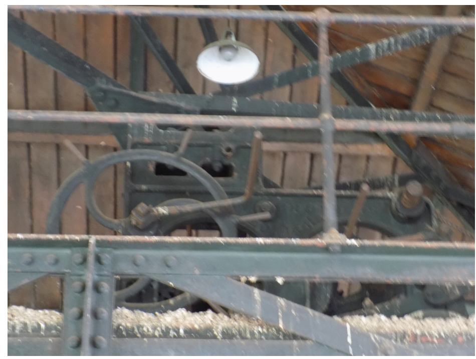
Figure 98: Hand-cranked gantry traveller (high significance)