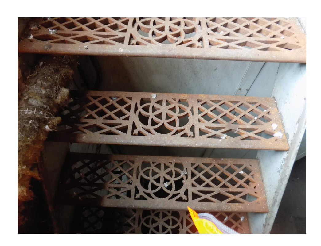
Figure 84 to 87: Cast-iron columns, entablature and metal staircases (all medium significance)