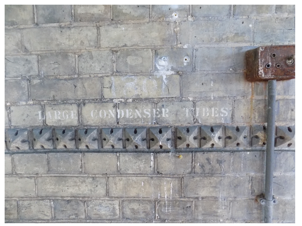
Figures 101: Stencilled "Large Condenser Tubes" (one of two) (high significance)