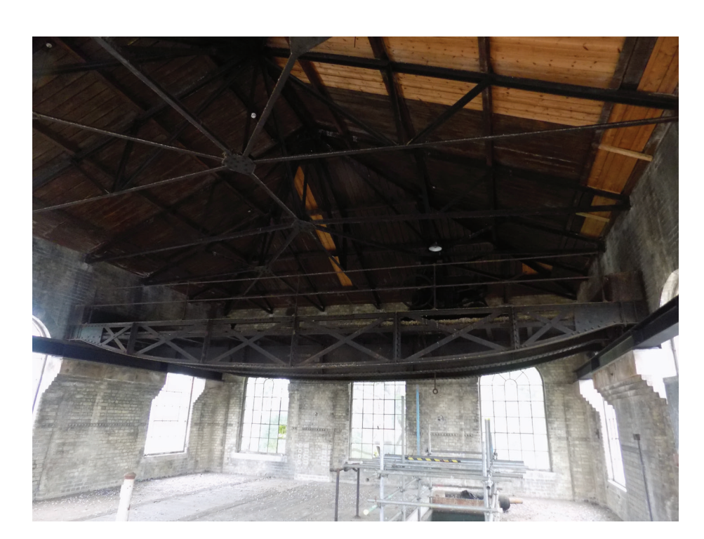
Figures 88 to 89: Beam loft floor and spring beams, gantry and cast-iron windows (all high significance)