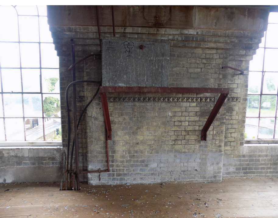
Figures 100: Header tank on welded steel supports (no significance)