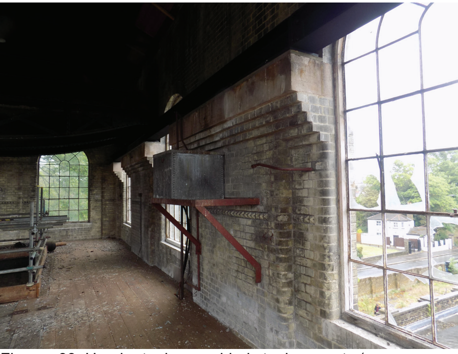
Figures 99: Header tank on welded steel supports (no significance)