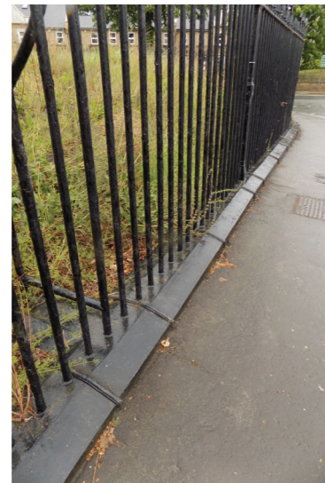
Figure 147: Detail of listed railings on Upper Sunbury (high significance)