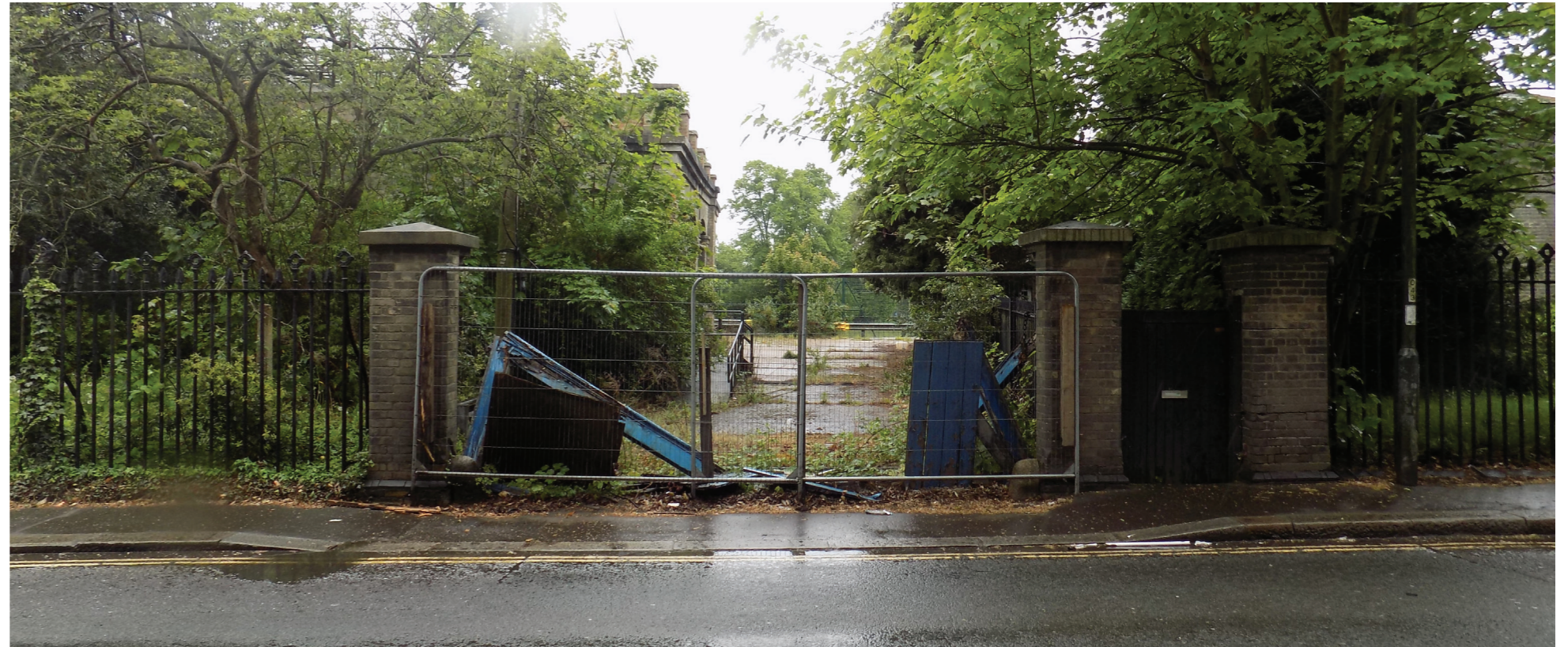
Figure 146: Brick piers showing principal vehicle and pedestrian entrance adjacent to Cottages and Ruston Boiler House, (high significance)