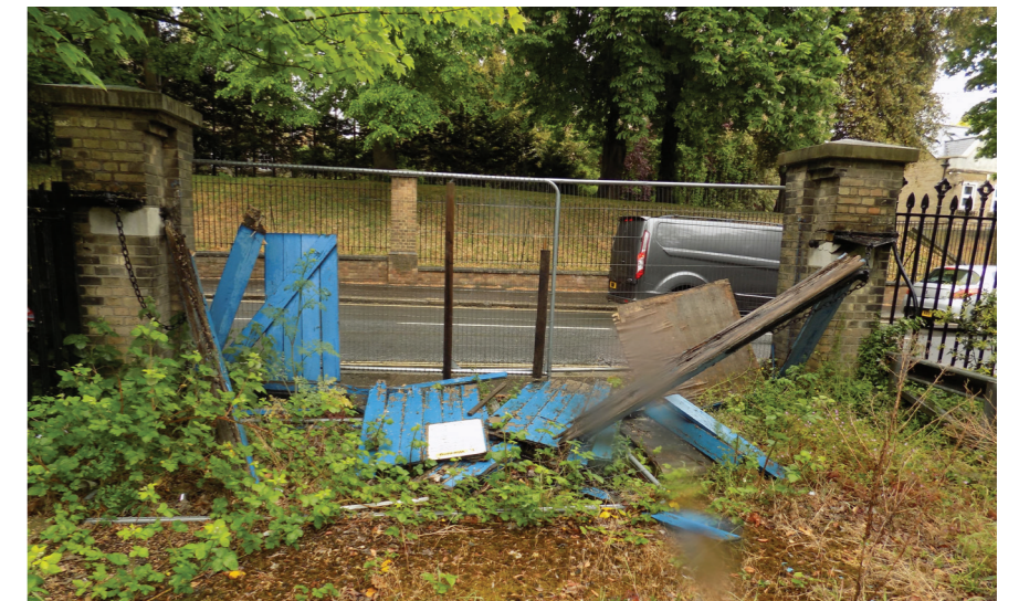
Figure 146: Timber fence to be reinstated to match historic precedent.