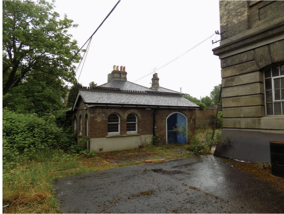
Figure 144: Storehouse exterior with cottage roof and chimney pots evident behind.