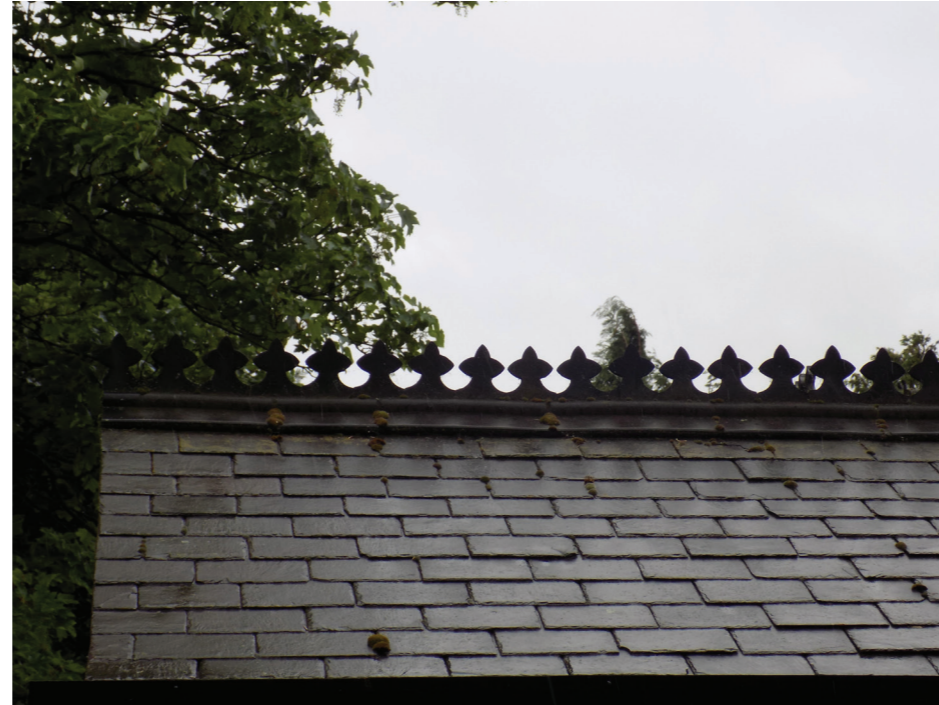
Figure 145: Ridge detail on Store house