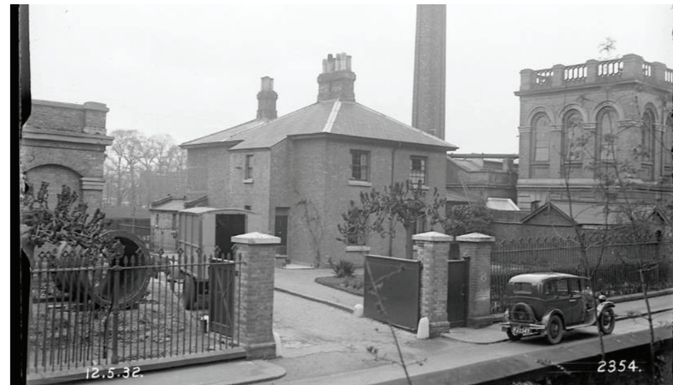
Figure 147: Historical photo showing arrangement of main entry to the site.