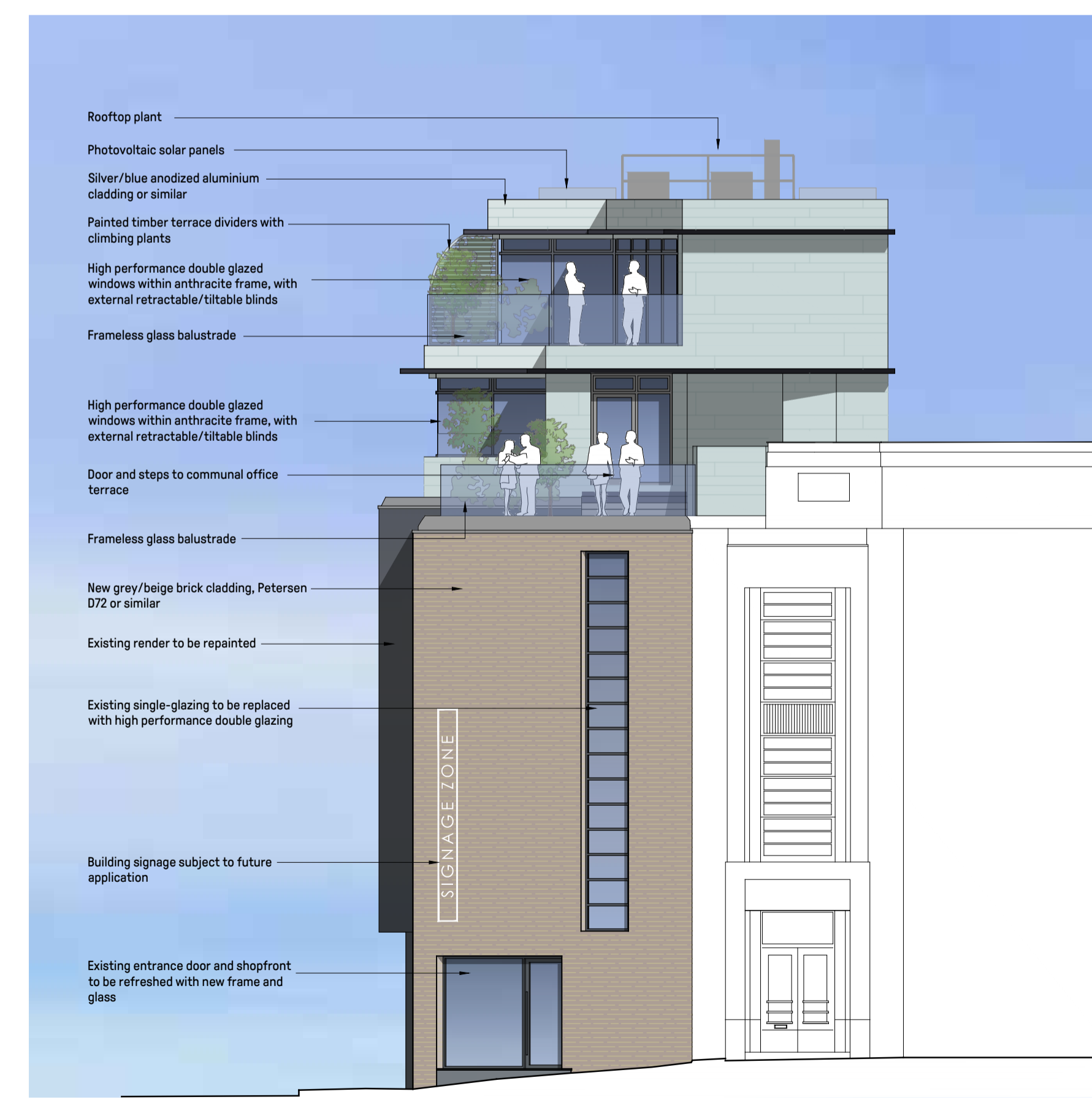
2 PROPOSED SIDE (SOUTH) ELEVATION 1 : 100