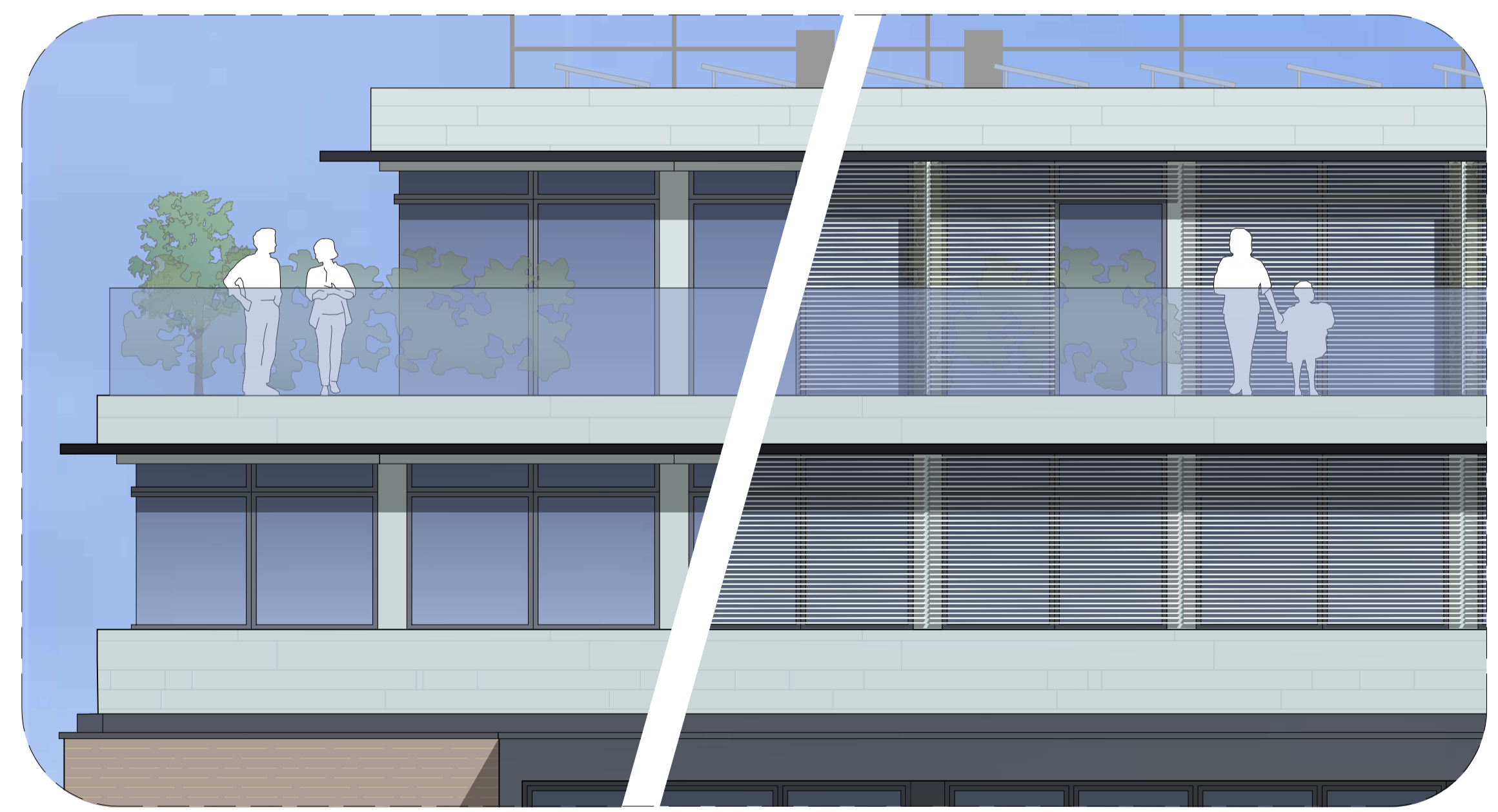
3 EXTRACT SHOWING BLINDS UP Vs DOWN 1 : 50