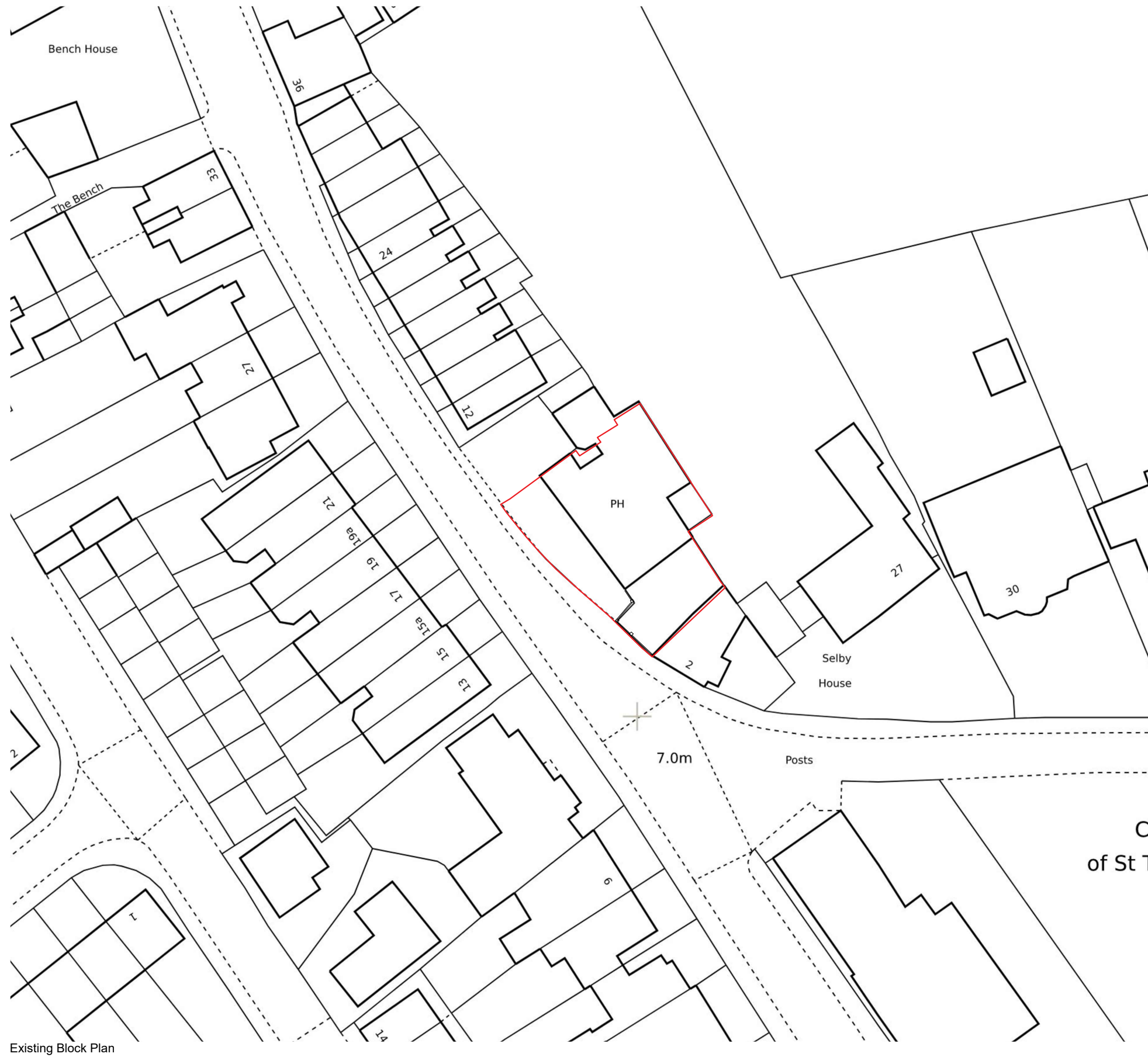
Existing Block Plan

Any dimensions shown should be checked on site and discrepancies reported to the Architect prior to construction. Designs are not coordinated with engineer projects. Do not scale for construction purposes.