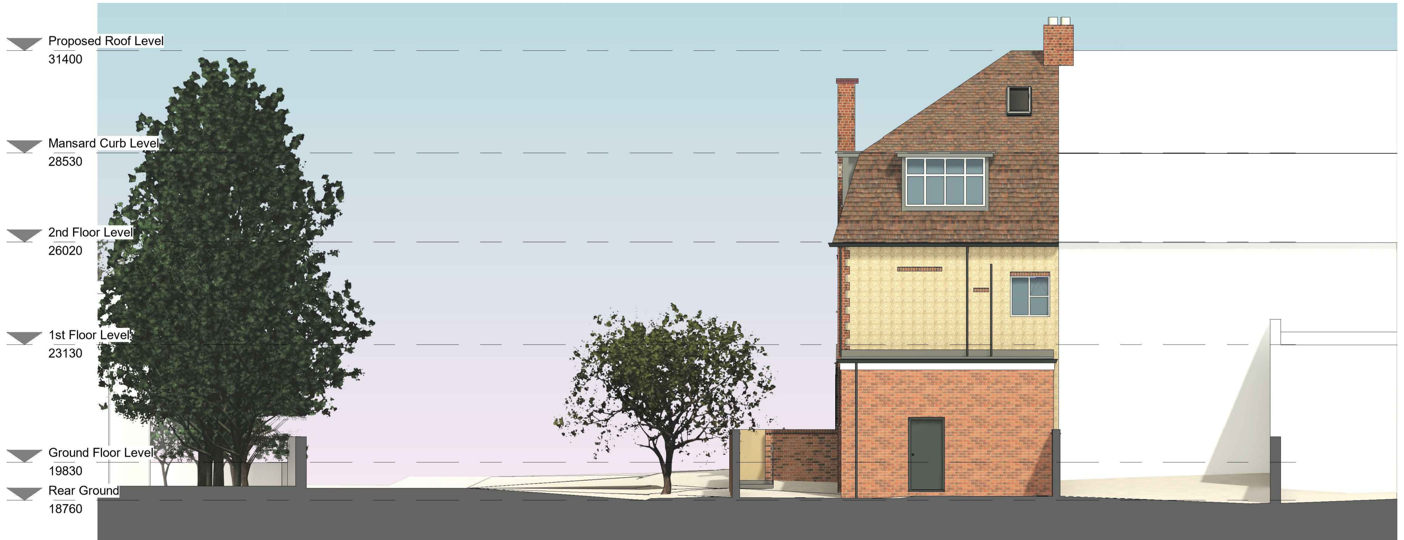
1 Proposed West Elevation 1 : 100

NOTES: 1. THIS DRAWING IS COPYRIGHT AND MUST NOT BE REPRODUCED IN WHOLE OR IN PART WITHOUT WRITTEN PERMISSION OF GAA DESIGN. 2. THIS DRAWING REPRESENTS DESIGN INTENT AND CONCEPT ONLY. HENCE, IT CAN BE SCALED FOR PLANNING PURPOSES ONLY. 3. THIS DOCUMENT AND ALL ASSOCIATED DOCUMENTS ARE PREPARED FOR SPECIFIC SITE AND EVENT, AND INCORPORATE CALCULATIONS AND MEASUREMENTS AVAILABLE FROM THE CLIENT AT THE TIME OF DRAFTING. 4. THE RECIPIENT AGREES TO PROTECT THE CONTENTS FROM DISTRIBUTION AND DISSEMINATION EXCEPT AS REQUIRED FOR THE SPECIFIC EVENT NAMED, WITHOUT THE WRITTEN PERMISSION OF THE DESIGNER. 5. USE OF THIS DESIGN IS GRANTED TO THE CLIENT FOR THE SPECIFIC AND NAMED EVENT ONLY. COPYRIGHT © 2019