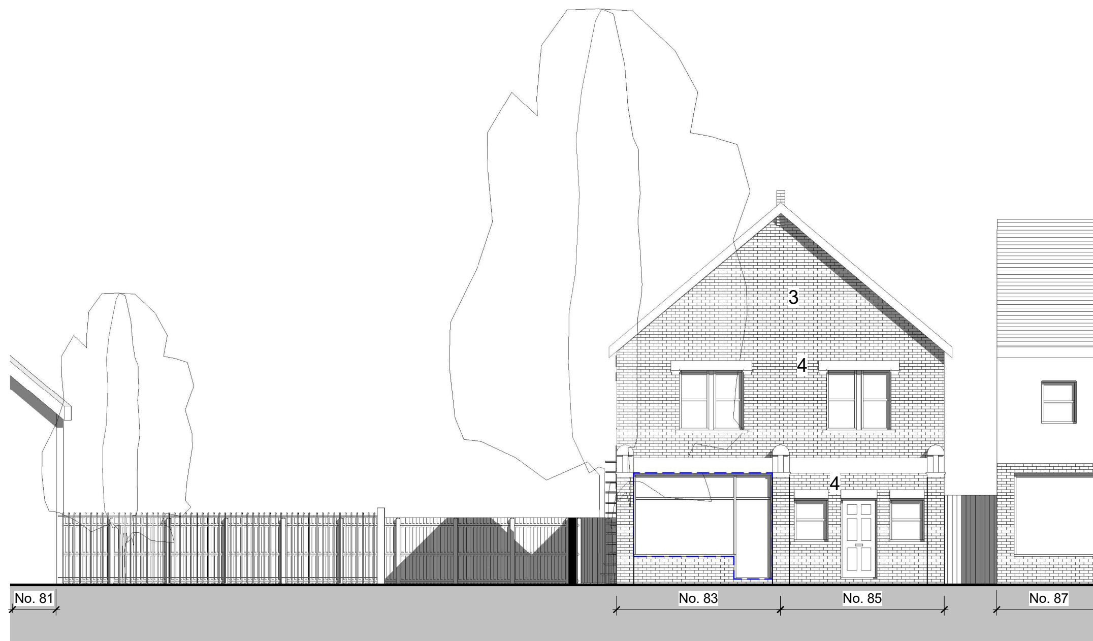
PROPOSED NORTH ELEVATION 1 : 100